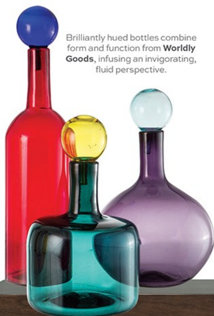
Brilliantly hued bottles combine form and function from Worldly Goods , infusing an invigorating, fluid perspective.