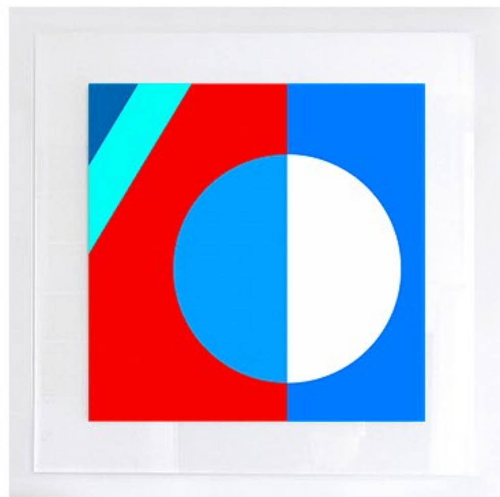
Dividing Line No. 2 from Wendy Concannon uses color and shape to create a dynamic, visually harmonious artwork in this abstract photograph, part of a limited edition of 11.