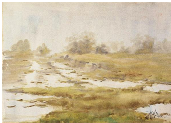
Marshland with Grey Mist, ca 1894. watercolor on paper, Rhode Island School of Design. #94.007

Dyer’s work can be found in many important collections including the Smithsonian American Art Museum, Corcoran Gallery of Art, the Strong Museum [Rochester, NY], the Nantucket Historical Association, and the Rhode Island Historical Society.