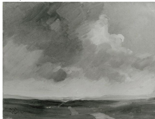
Landscape, ca. 1910, watercolor and gouache on paper, Rhode Island School of Design. #20.496