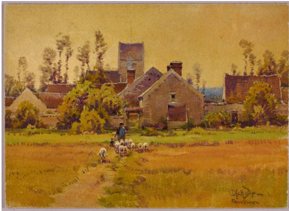
French Village, n.d. watercolor on paperboard, Smithsonian American Art Museum

a critic for American Art News stated, “Col. Dyer paints with appreciation and sympathy, gets true and delightful atmospheric and tonal effects, while his work is characterized by rare refinement.” 5