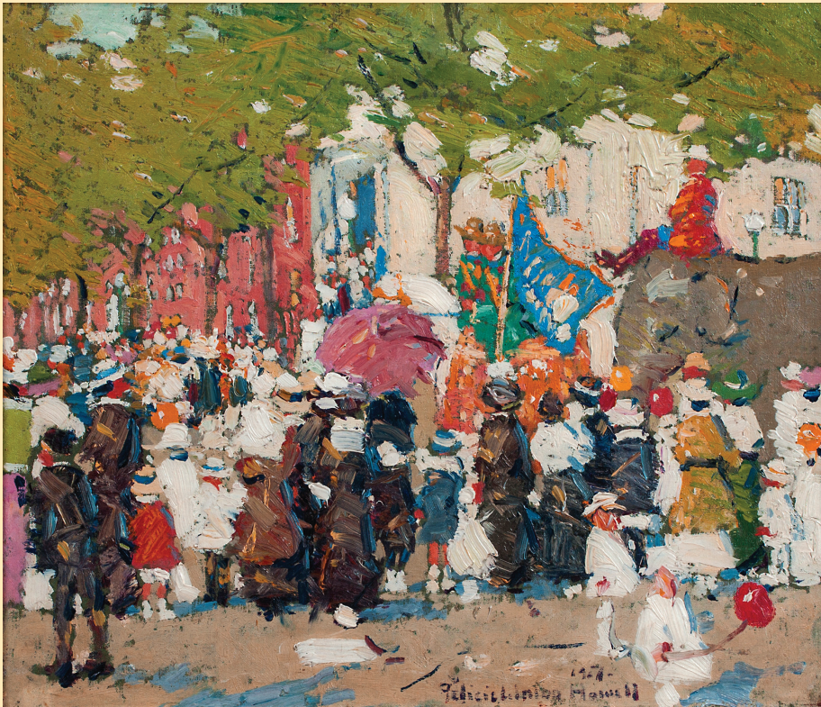
FELICIE WALDO HOWELL (1897–1968)

A Comprehensive Exploration of the Talents of Female American Painters and Sculptors