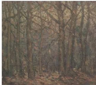
Laura Trevitte Horne, Autumn Forest Interior , undated. Oil on canvas, 16 x 18 inches. Private collection. 3

This scene captures the idyllic serenity of a warm spring day in Central Park where colorful trees surround a small cottage. The setting is likely on the west side of the park near 75th Street, where a small cottage once stood near the lake. 2 When Olmstead and Vaux designed Central Park, they were inspired by the aesthetic landscape of English picturesque gardens of the eighteenth century, which incorporated ponds and open meadows interspersed with winding paths and architectural follies. These follies sometimes took the form of rustic villages or cottages in order to heighten the sense of being in a rural setting.