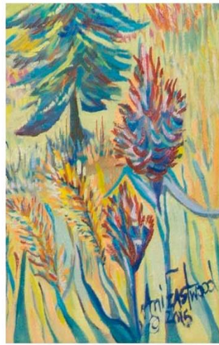
"Trapper's Peak, Montana" Ani Eastwood 2016