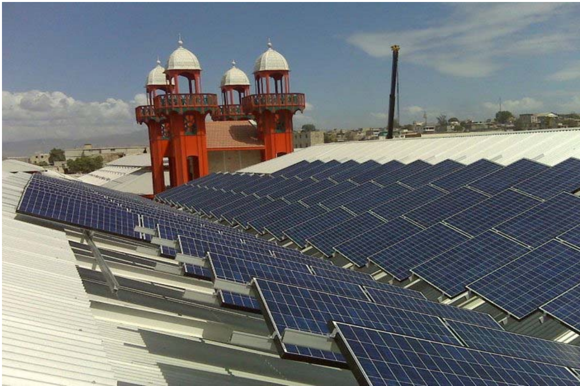
Iron Market Haiti_110KWhr PV Installation (currently the largest standalone system in the Caribbean)