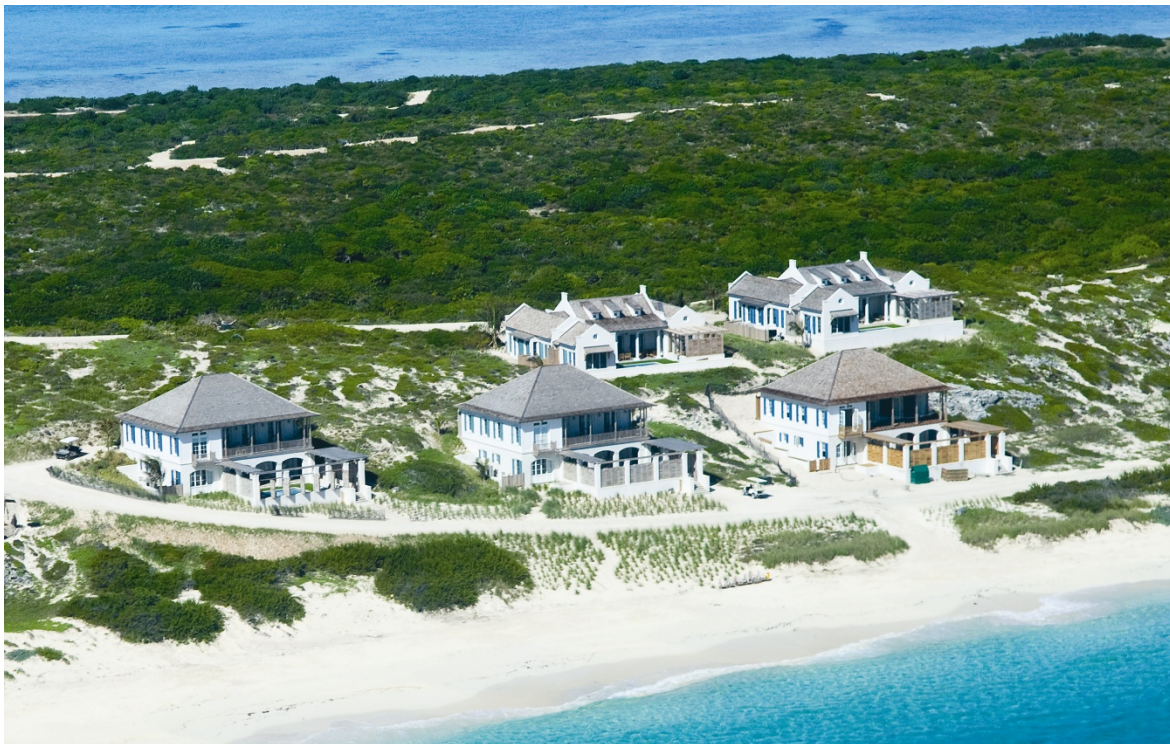
Le Grande Cottages, Ambergris Cay – Turks and Caicos Islands