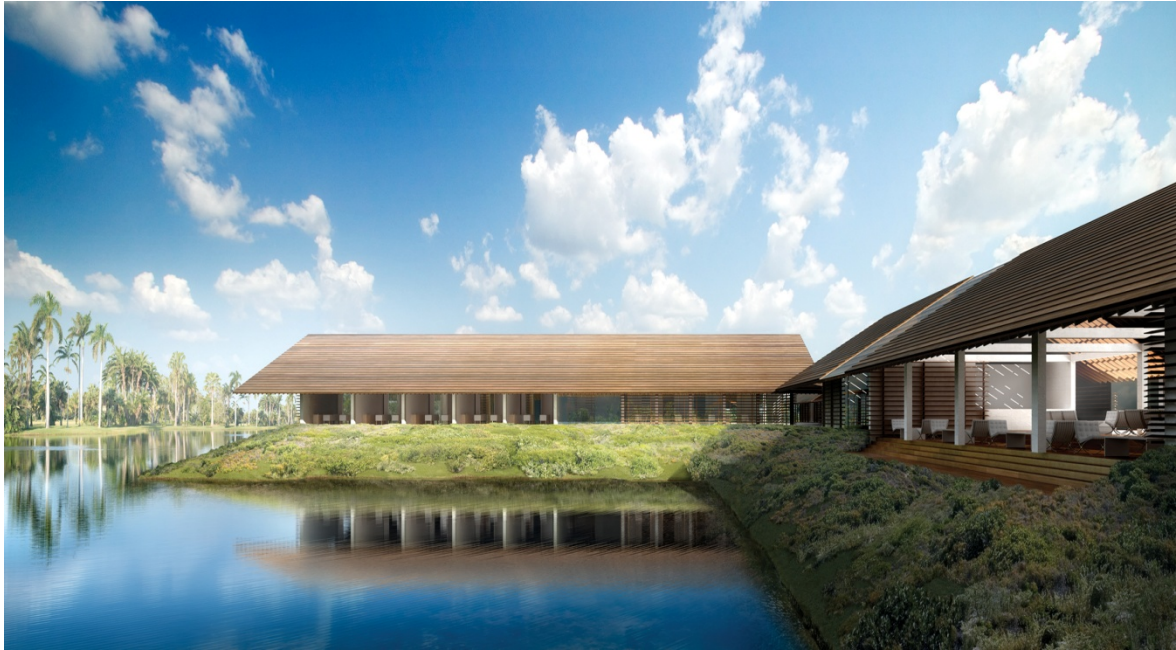
Dellis Cay – Spa, Turks and Caicos Islands