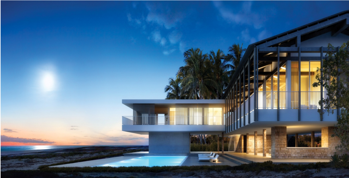
Dellis Cay - Beach Villa, Turks and Caicos Islands