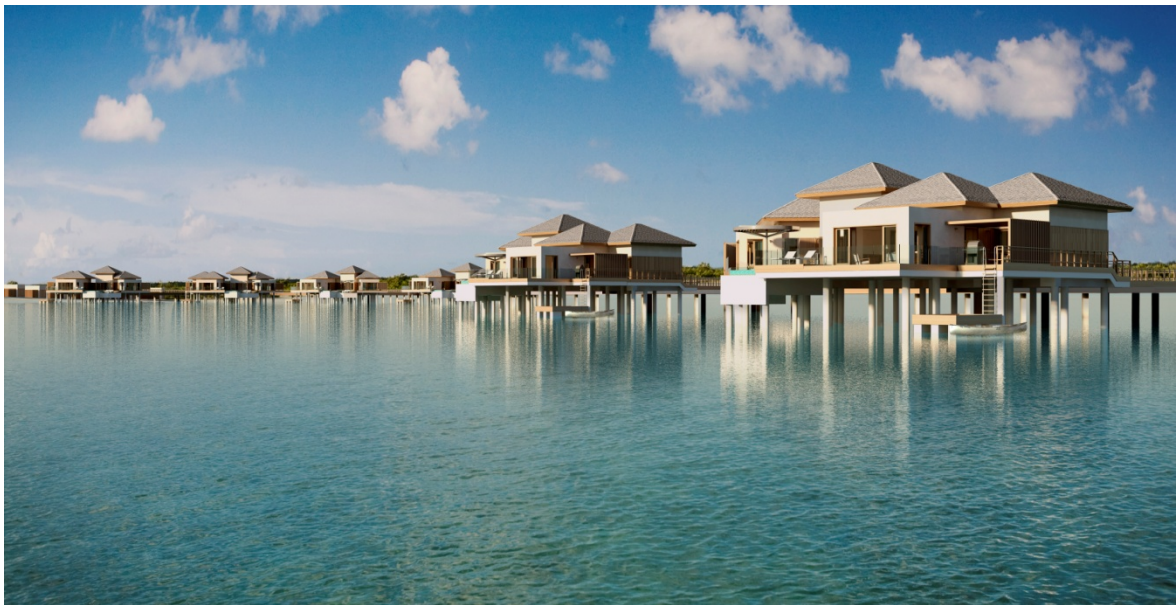
Dellis Cay - Over Water Villas, Turks and Caicos Islands