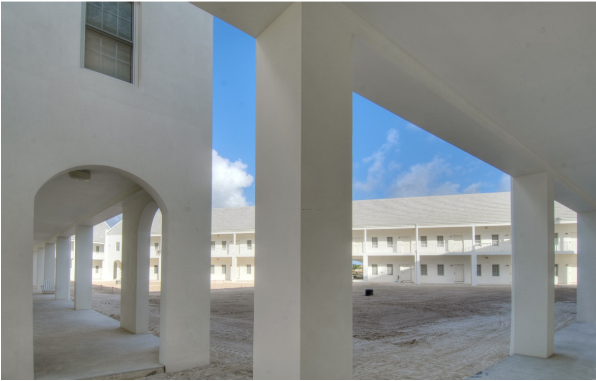
Two Storey Staff Housing, Ambergris Cay – Turks and Caicos Islands