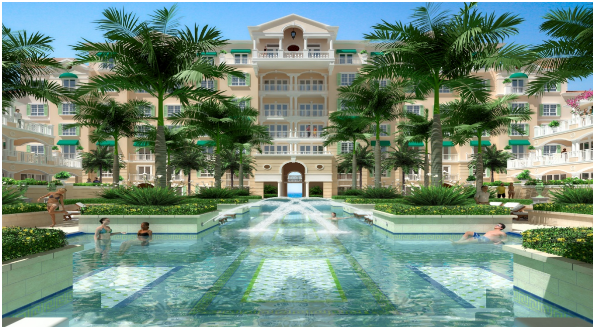
The Vellagio (Pool area and Building 1), Grace Bay Providenciales