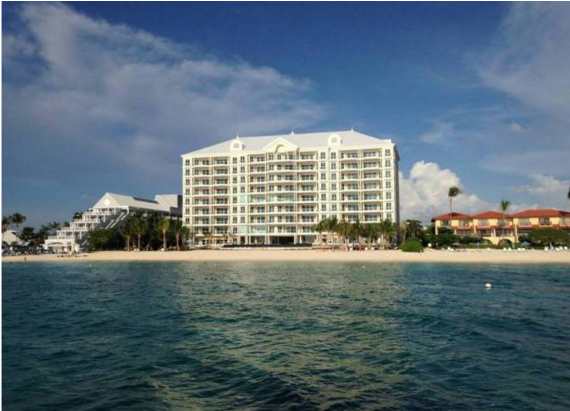
Water Colours Condo Development, Cayman Islands