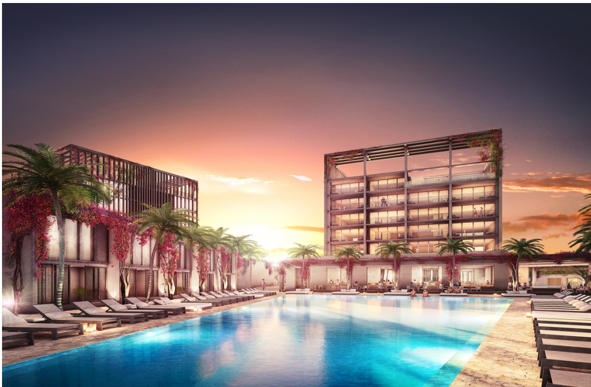
CAYA at Grace Bay, Providenciales