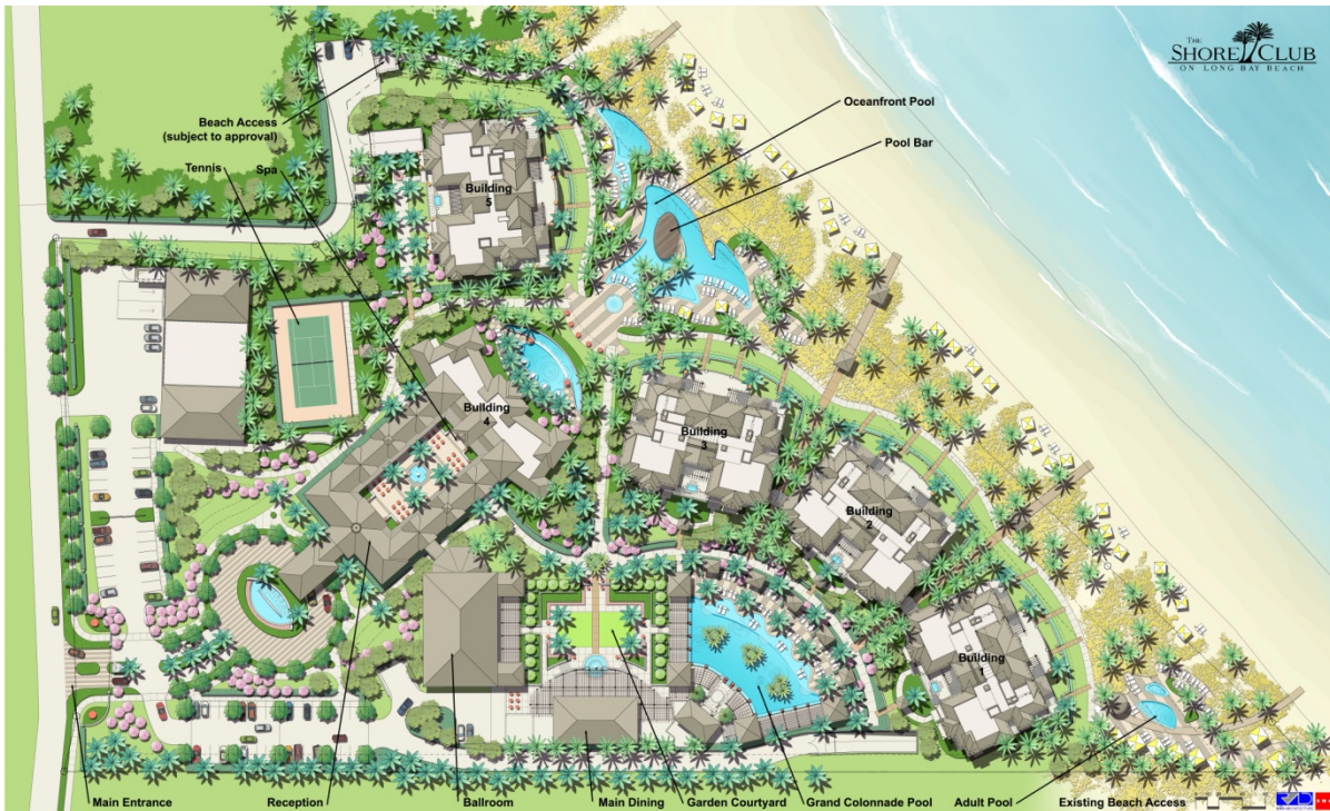
The Shore Club, Long Bay Beach, Providenciales