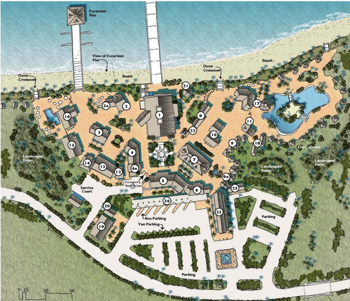
Carnival Cruise Line Terminal, Grand Turk – Turks and Caicos Islands