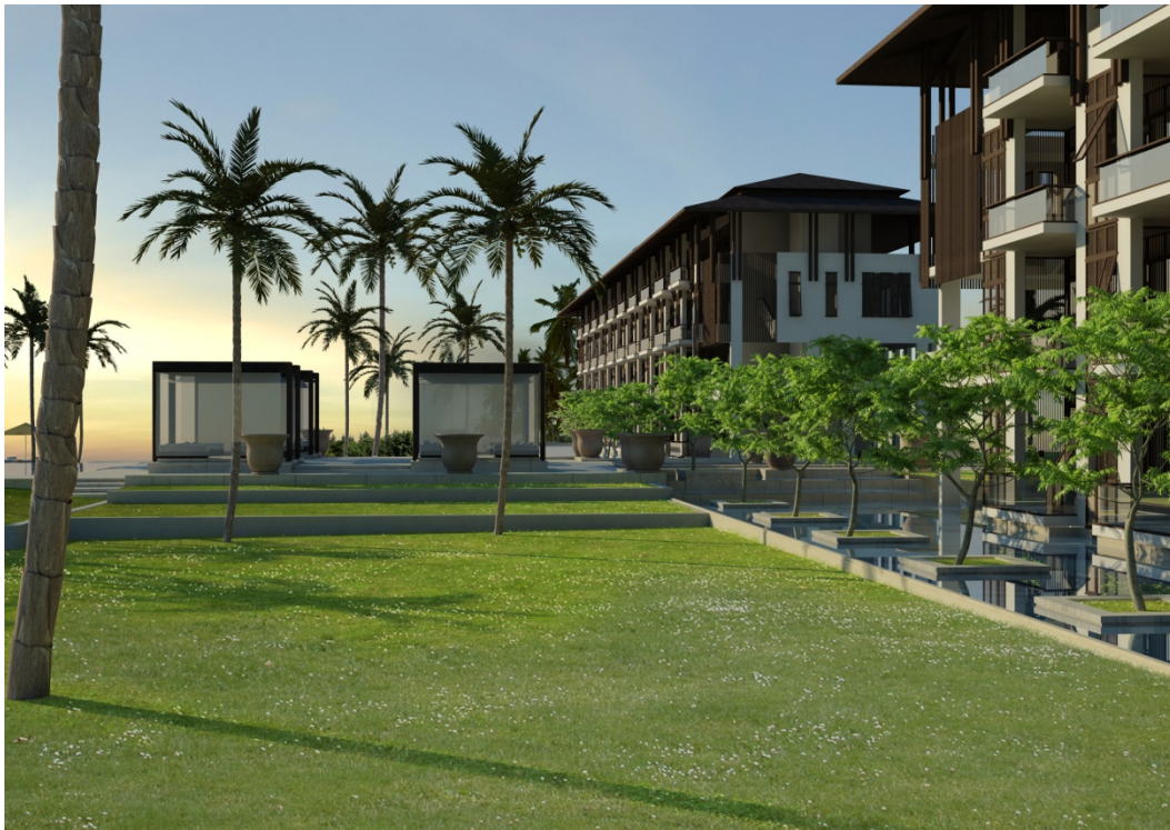
Tanai Hotel -General View, Northwest Point, Providenciales