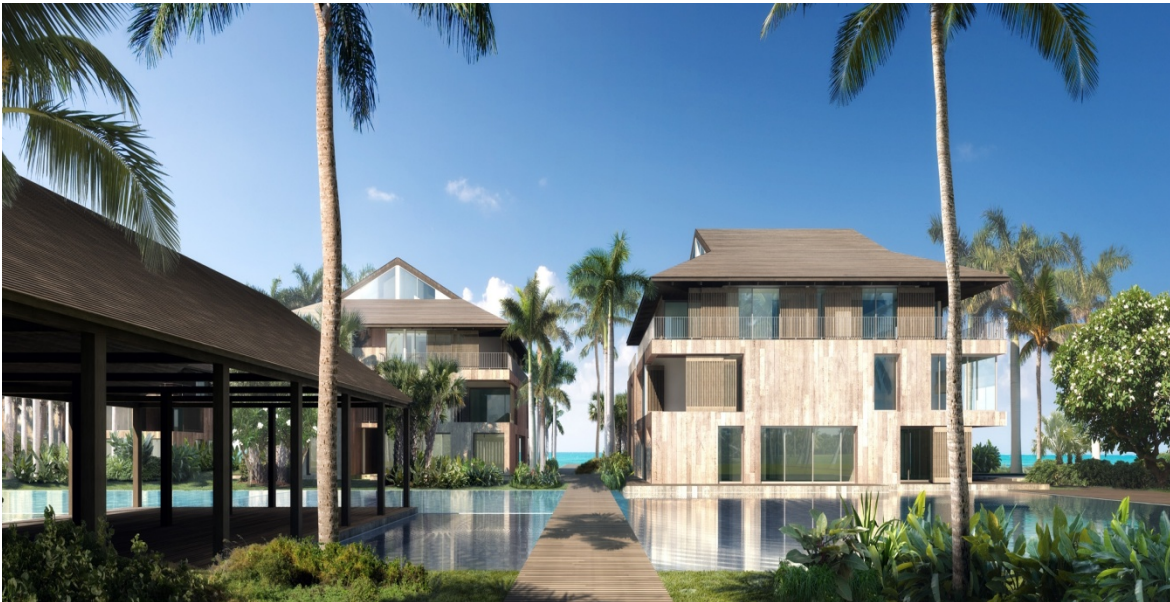
Dellis Cay – Beach House Residence, Turks and Caicos Islands