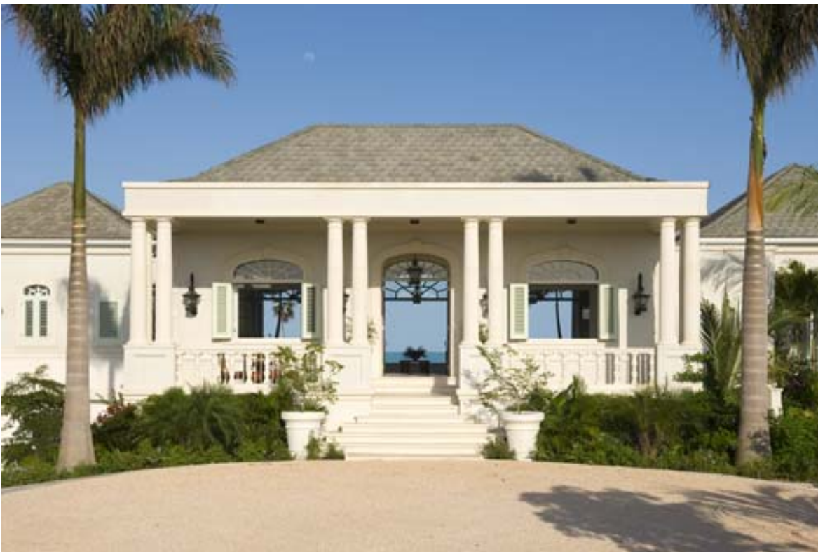
Long Bay (Private Residence) – Providenciales

Retained by Architects and Clients for complete MEP design on a various number of high-end private residences throughout the Turks and Caicos Islands. Project values in range of $1M-$20M