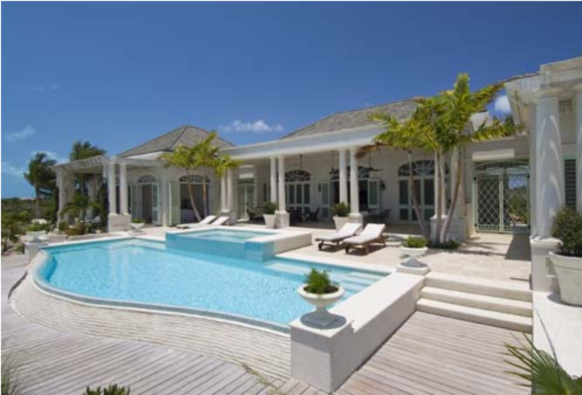
Private Residence, Long Bay – Providenciales