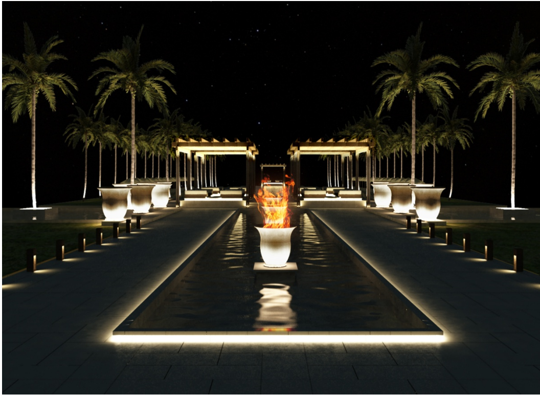
Tanai Hotel – Lobby Plaza at Night, Northwest Point - Providenciales