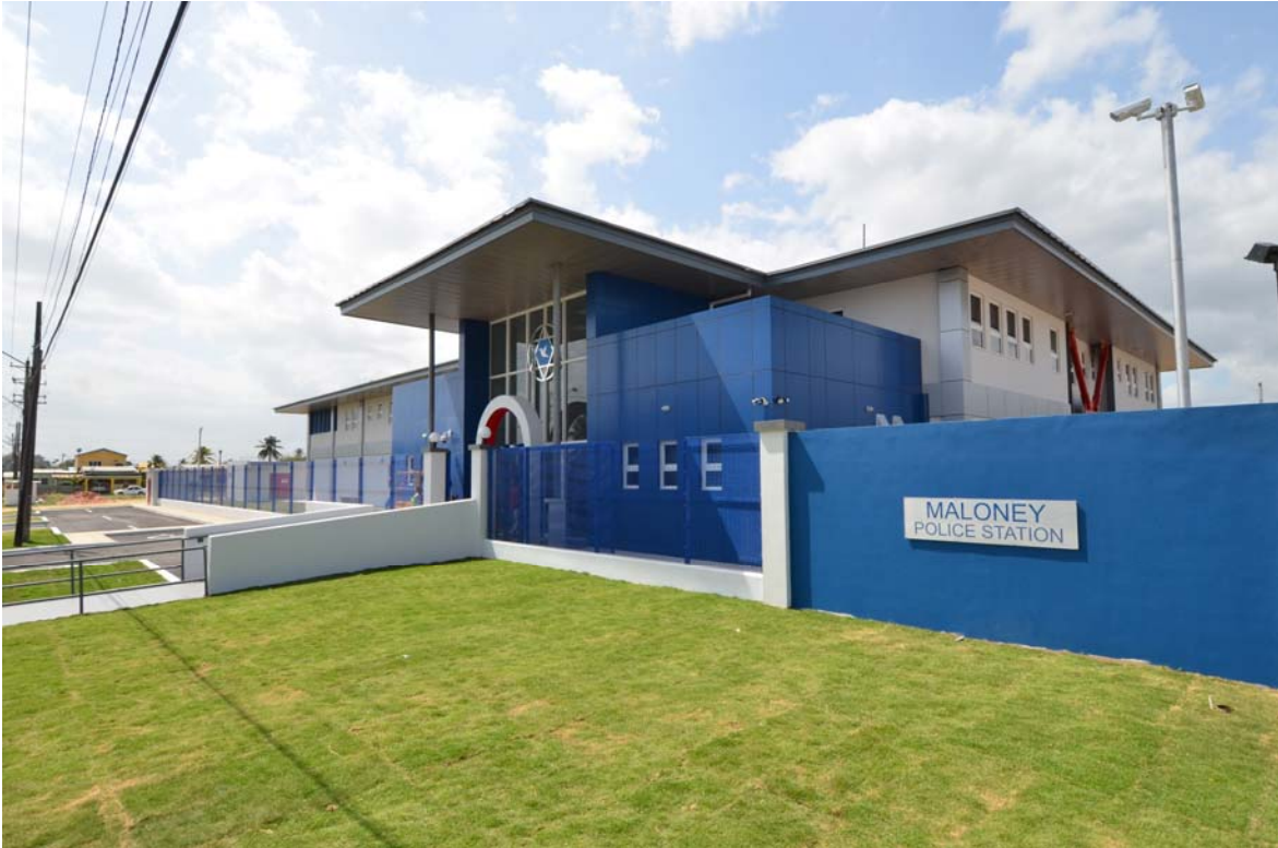
Maloney Police Station – Trinidad