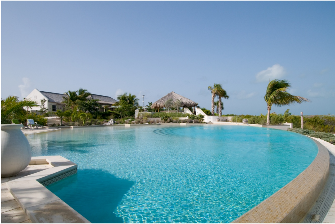
Calico Jack Pavillion, Ambergris Cay – Turks and Caicos Islands