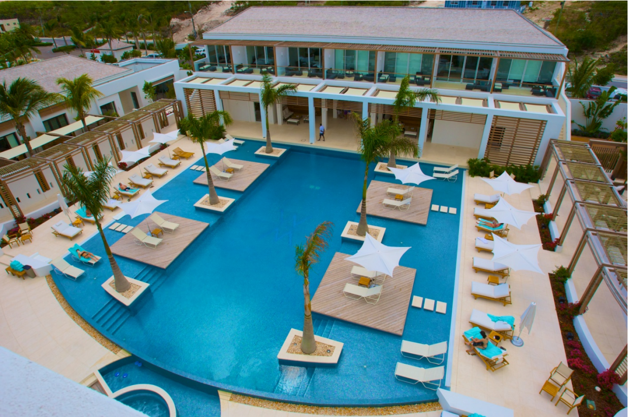
Gansevoort Turks & Caicos a Wymara Resort, Providenciales