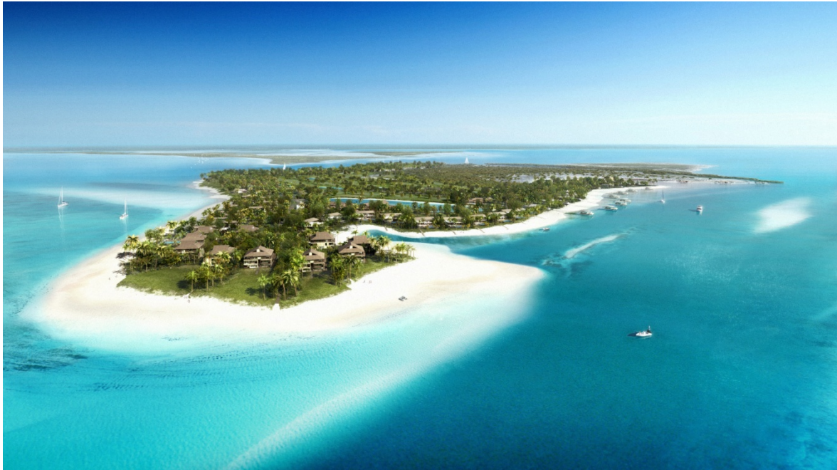
Dellis Cay – Aerial View of Peninsula, Turks and Caicos Islands