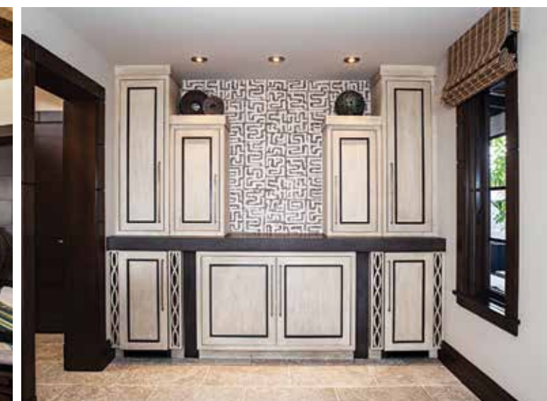
Double helix columns and multilevel cabinetry are featured in the dry bar.