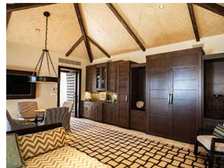
The guesthouse cabinetry conceals a fold-down bed that leaves room for more entertaining.