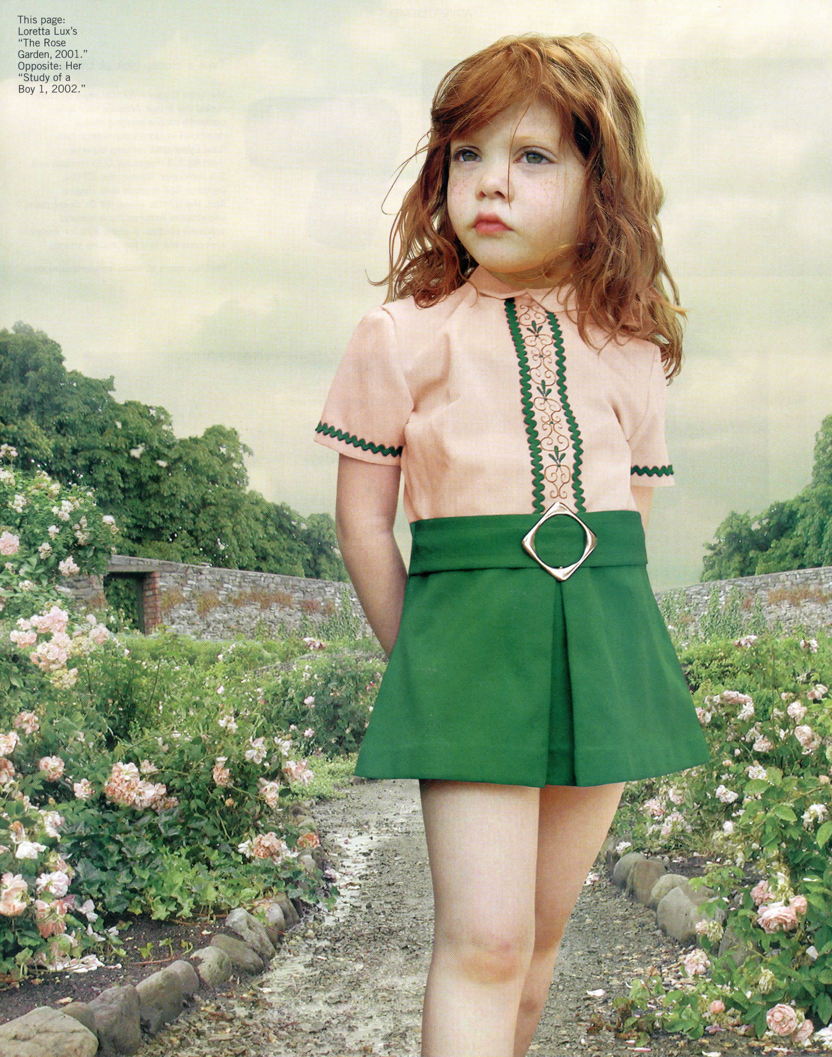
This page: Loretta Lux's "The Rose Garden, 2001." Opposite: Her "Study of a Boy 1, 2002."