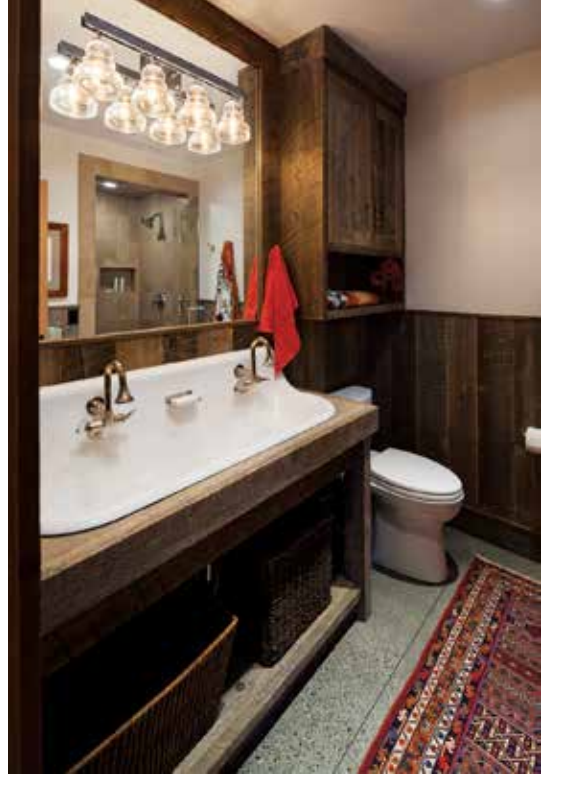
ABOVE: With an eye toward achieving a certain cohesiveness throughout the home, Brechbuhler Architects selected the stains, wall colors, tile, and countertops, as well as all the cabinet fixtures and bathroom accessories. LEFT: By way of paying homage to the former structure, the wood behind the bed in the master bedroom was sourced from the old farmhouse's siding.