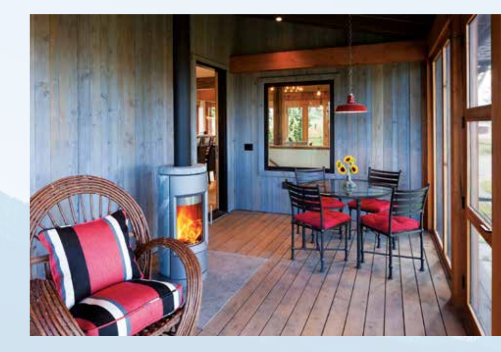
Located off of the great room, a covered porch helps keep the mosquitos at bay even while allowing fresh air to circulate. The fireplace is made from soapstone, and rotates on an axis to more evenly distribute its heat.

"It's like you are really living in the outdoors, but in a river and proximity to the first national park."