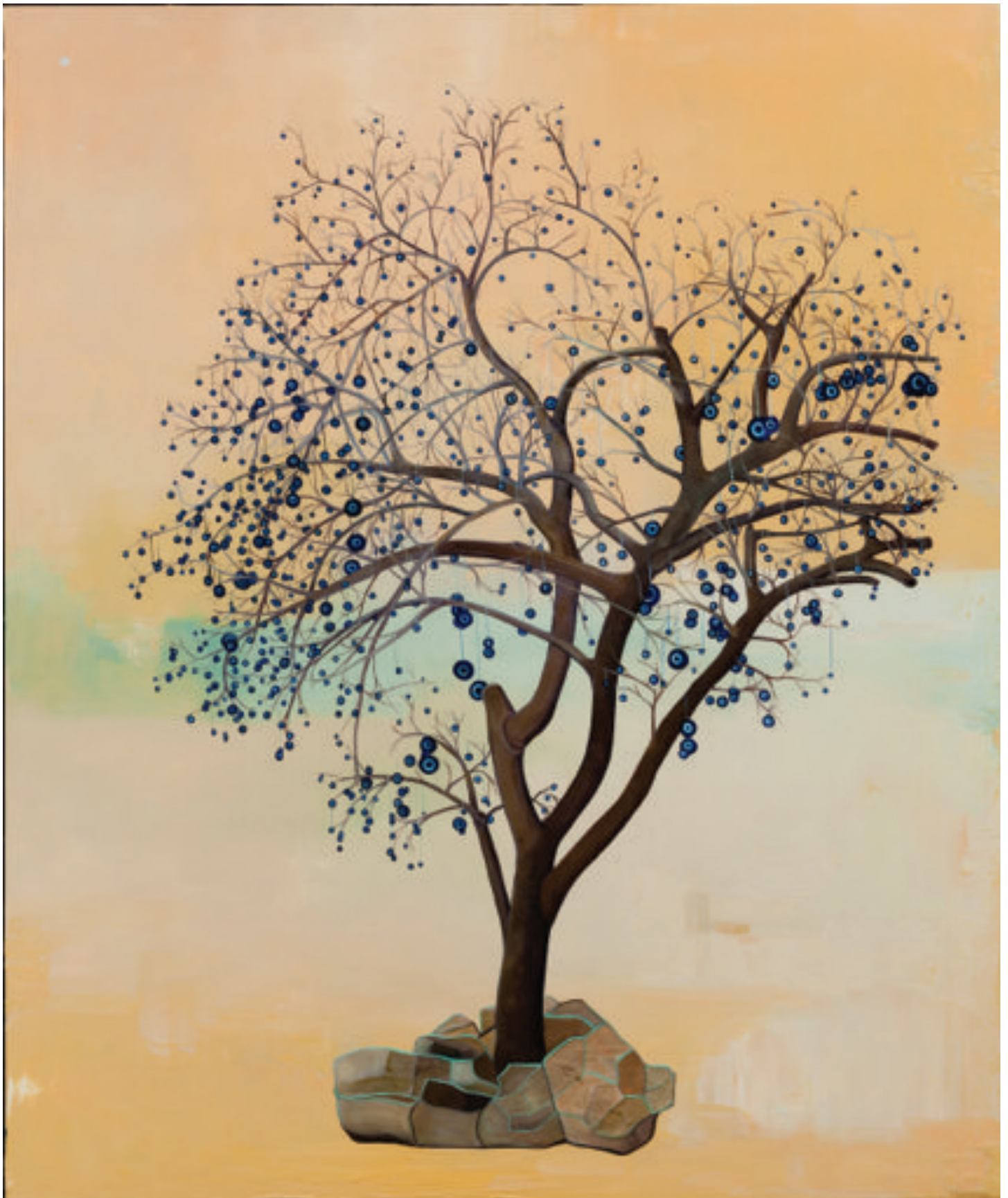
Tree of Burden 2014, Oil on Panel, 36" x 30"