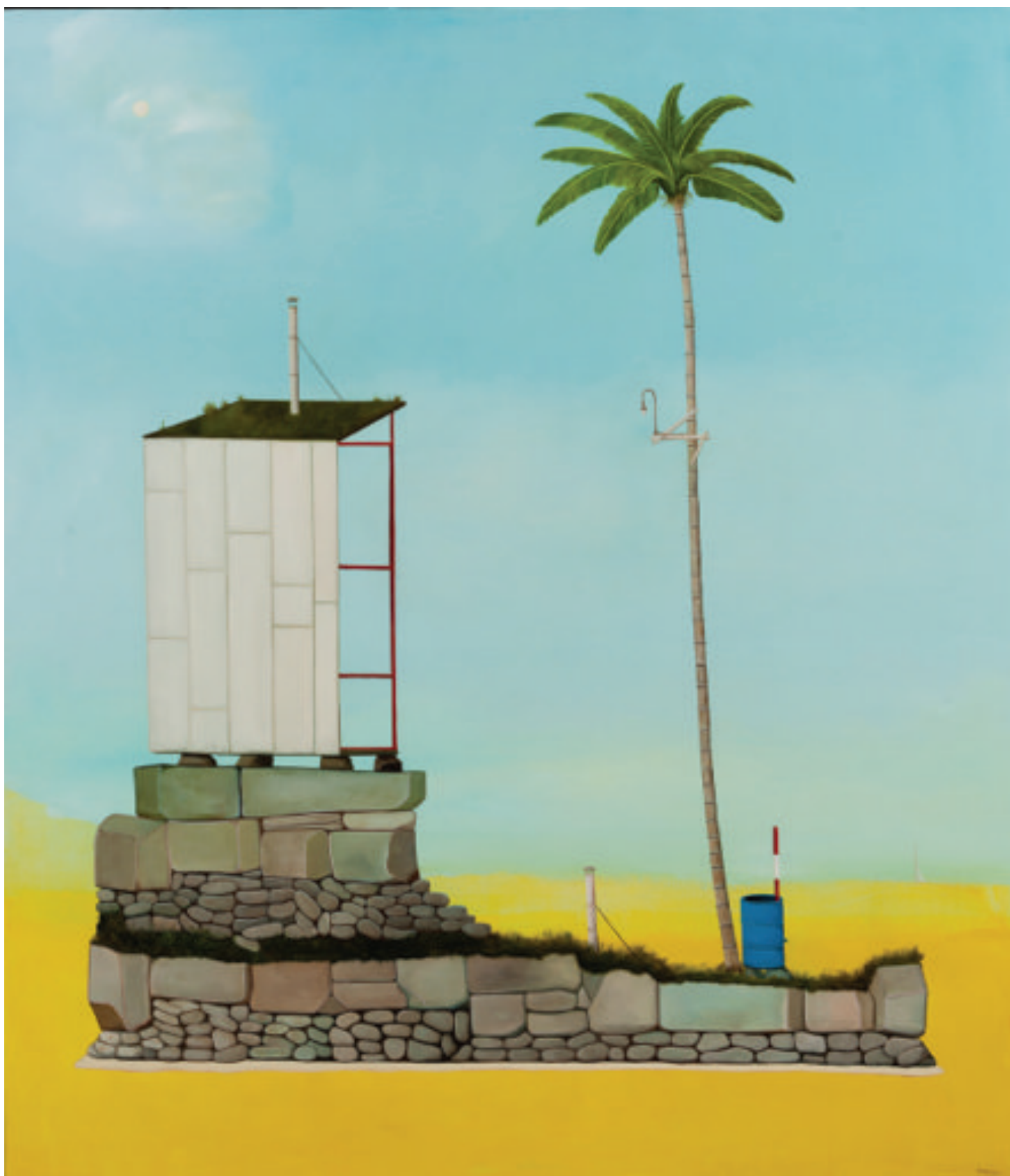
Gray Flower, 2013, oil on panel, 20" x 16"