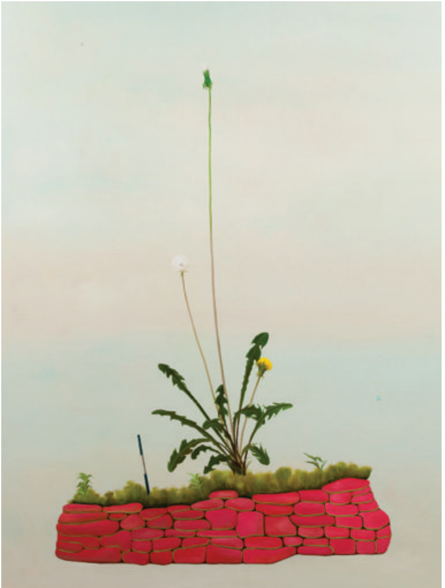
Dandelion, 2014, Oil on Panel, 45" x 56"