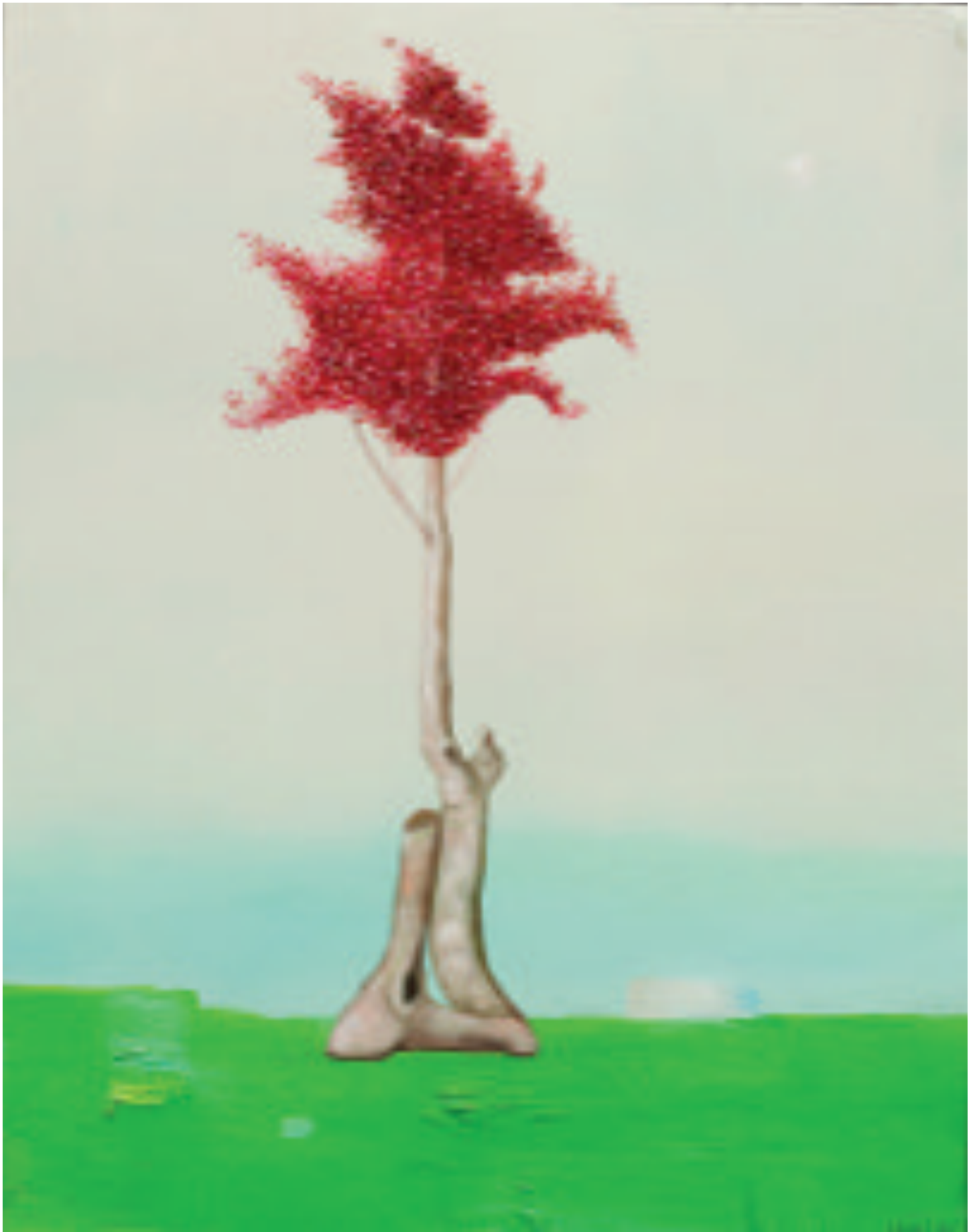
Near the Glacier 5, 2014, Oil on Panel, 14" x 11"