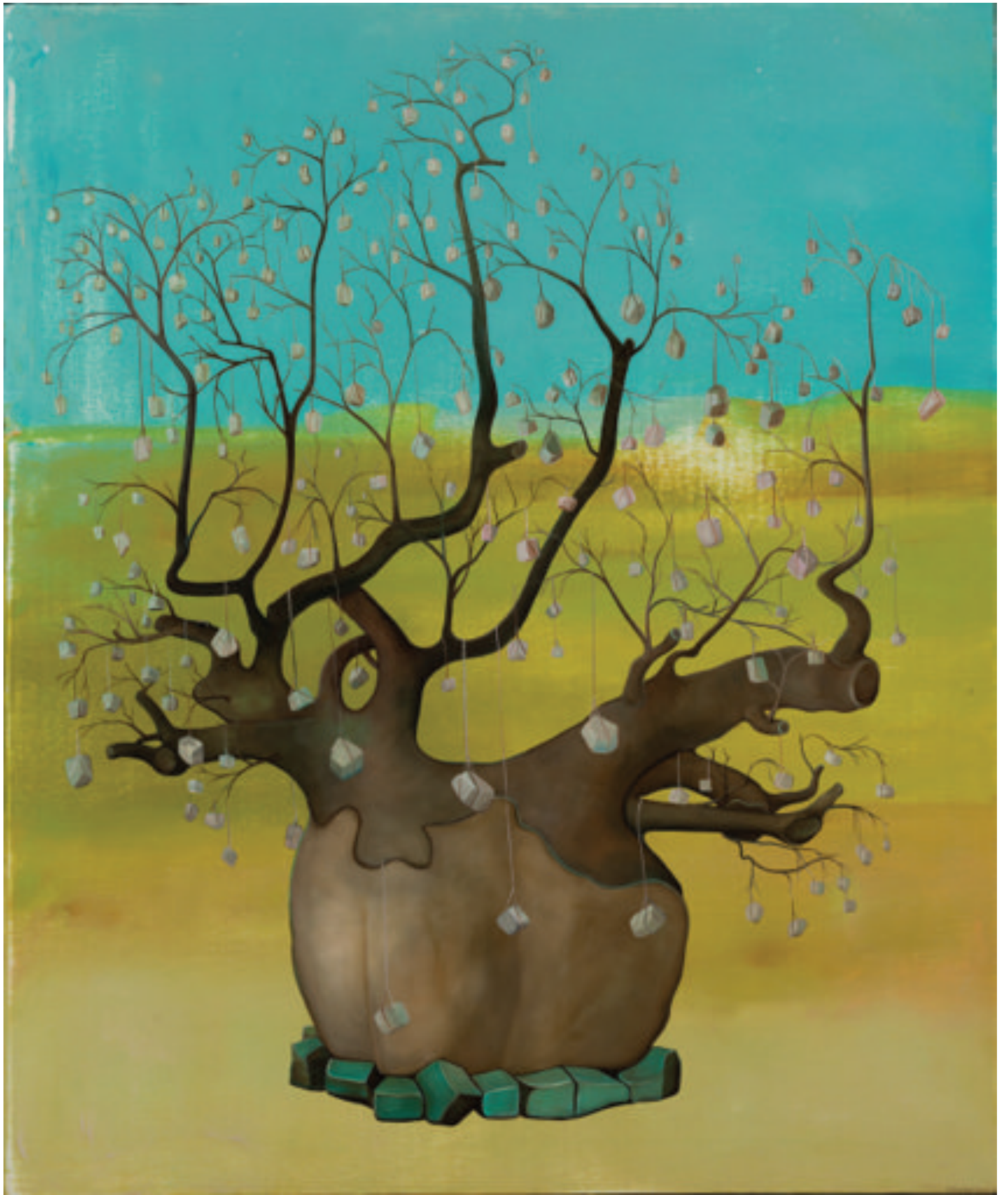
Kumquat, 2013, oil on panel, 14" x 11"