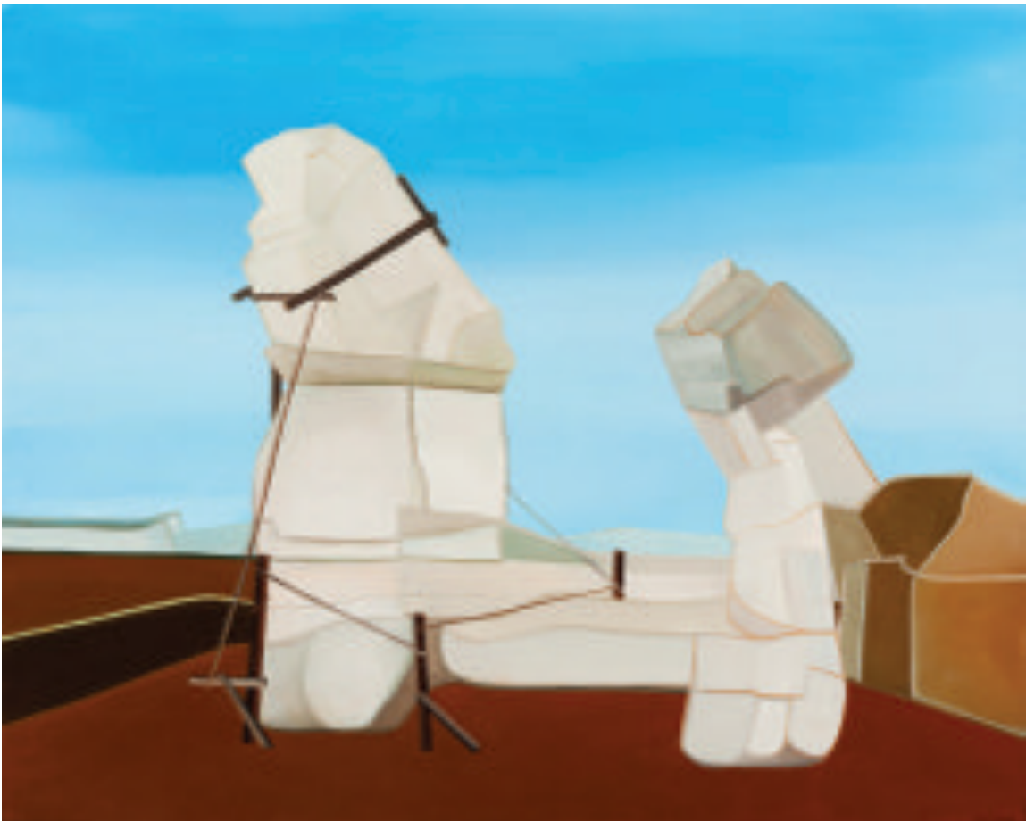
Ancient Stone Quarry 2, 2014, Oil on Panel, 20” x 16”