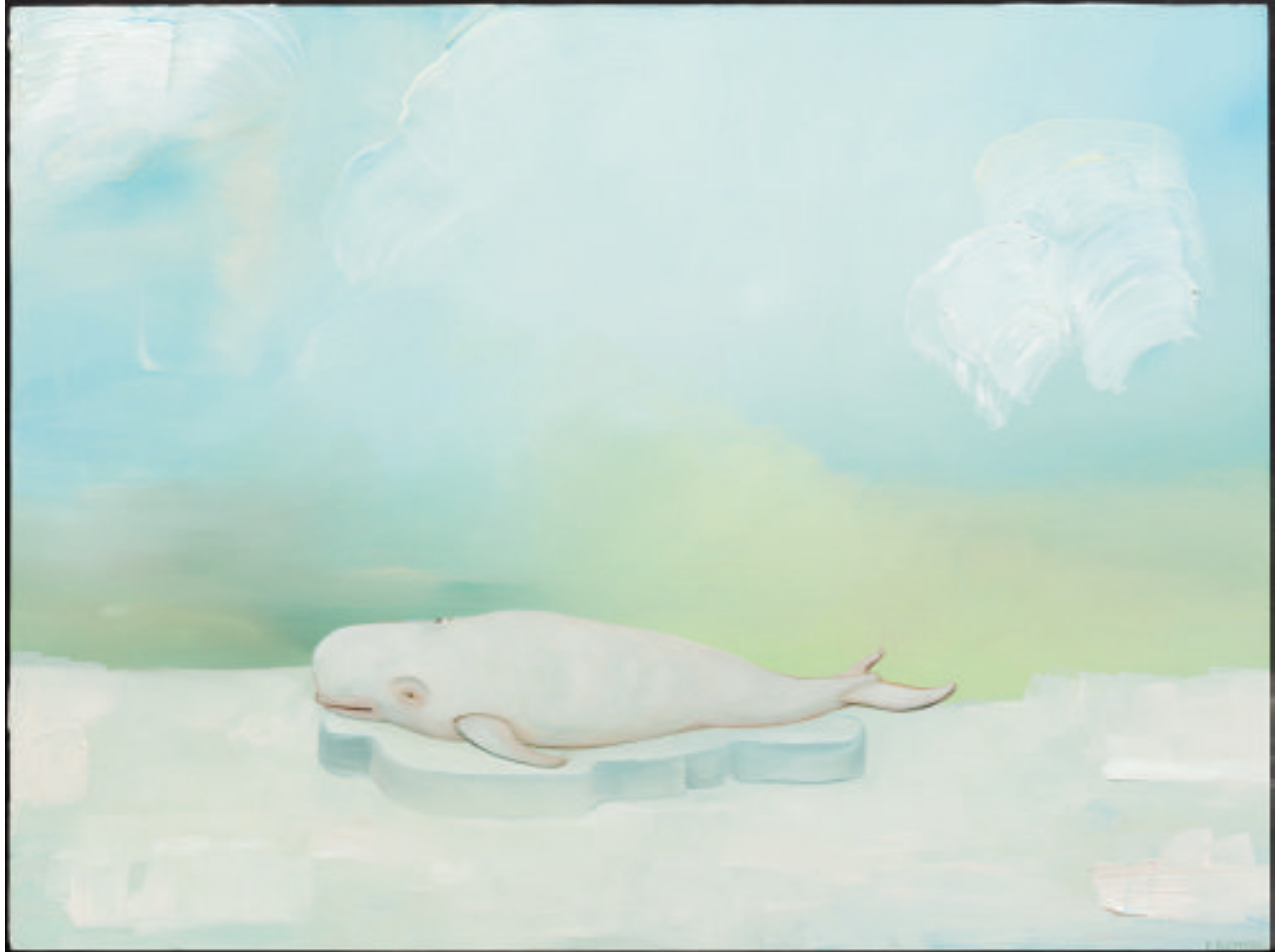
White Whale, 2014, Oil on Panel, 12" x 16"