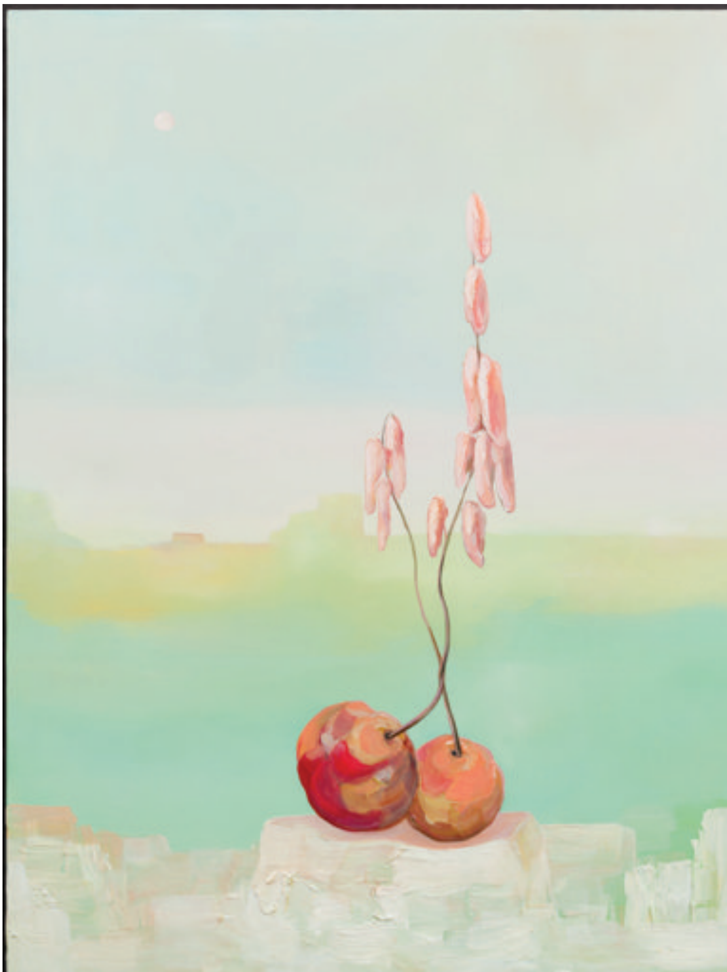
Kumquat, 2013, oil on panel, 14" x 11"