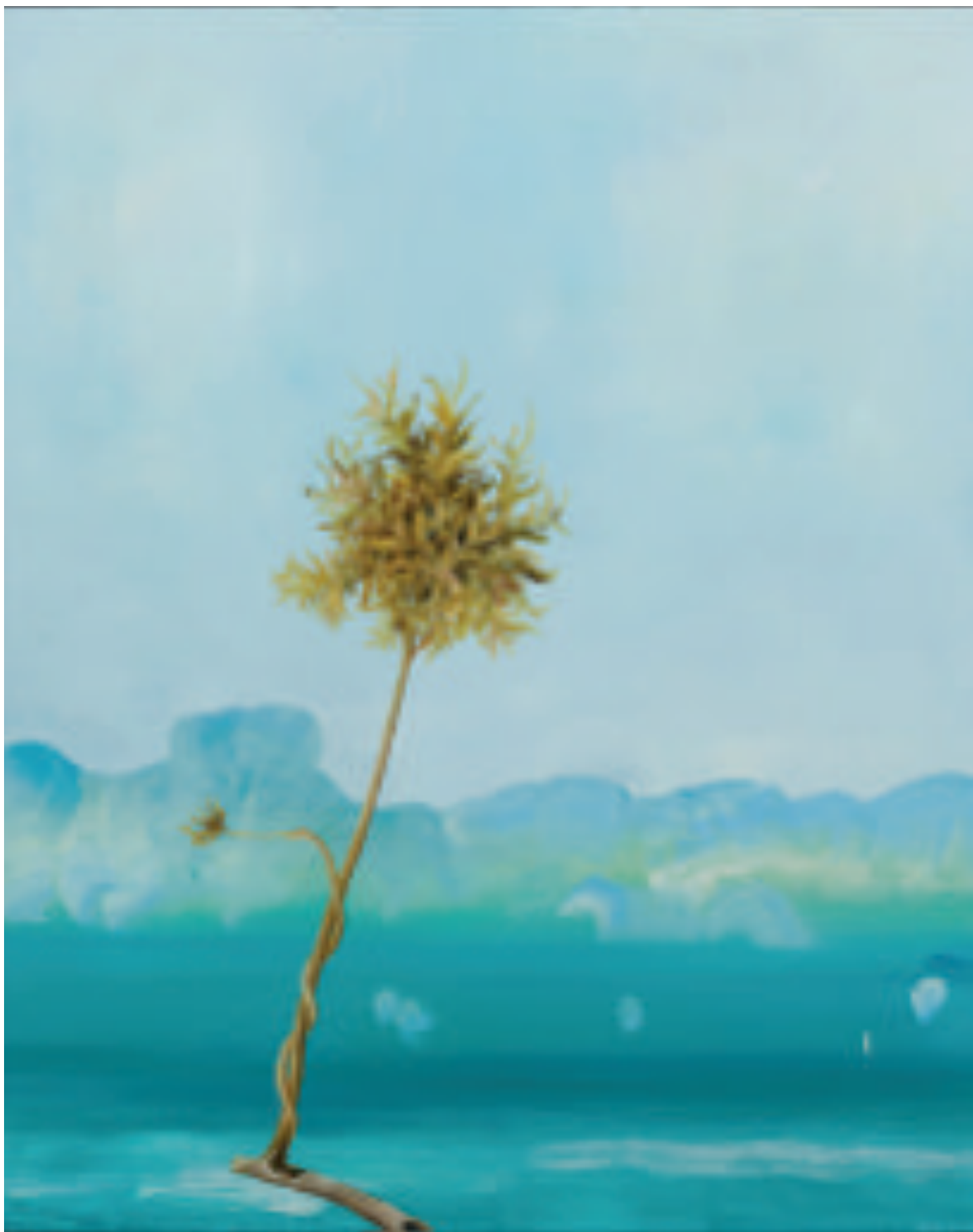
White Blossom, 2013, oil on panel, 20" x 16"