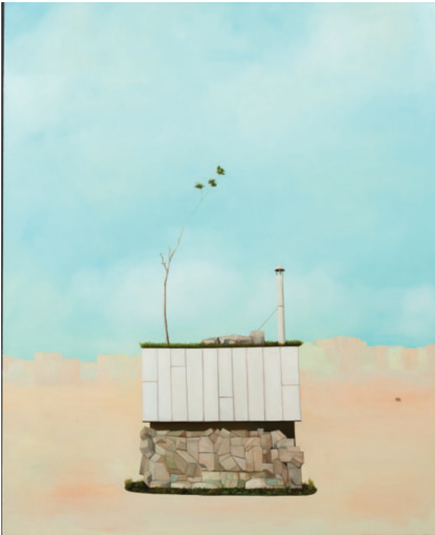
The Oasis, 2014, Oil on Panel, 45" x 56"