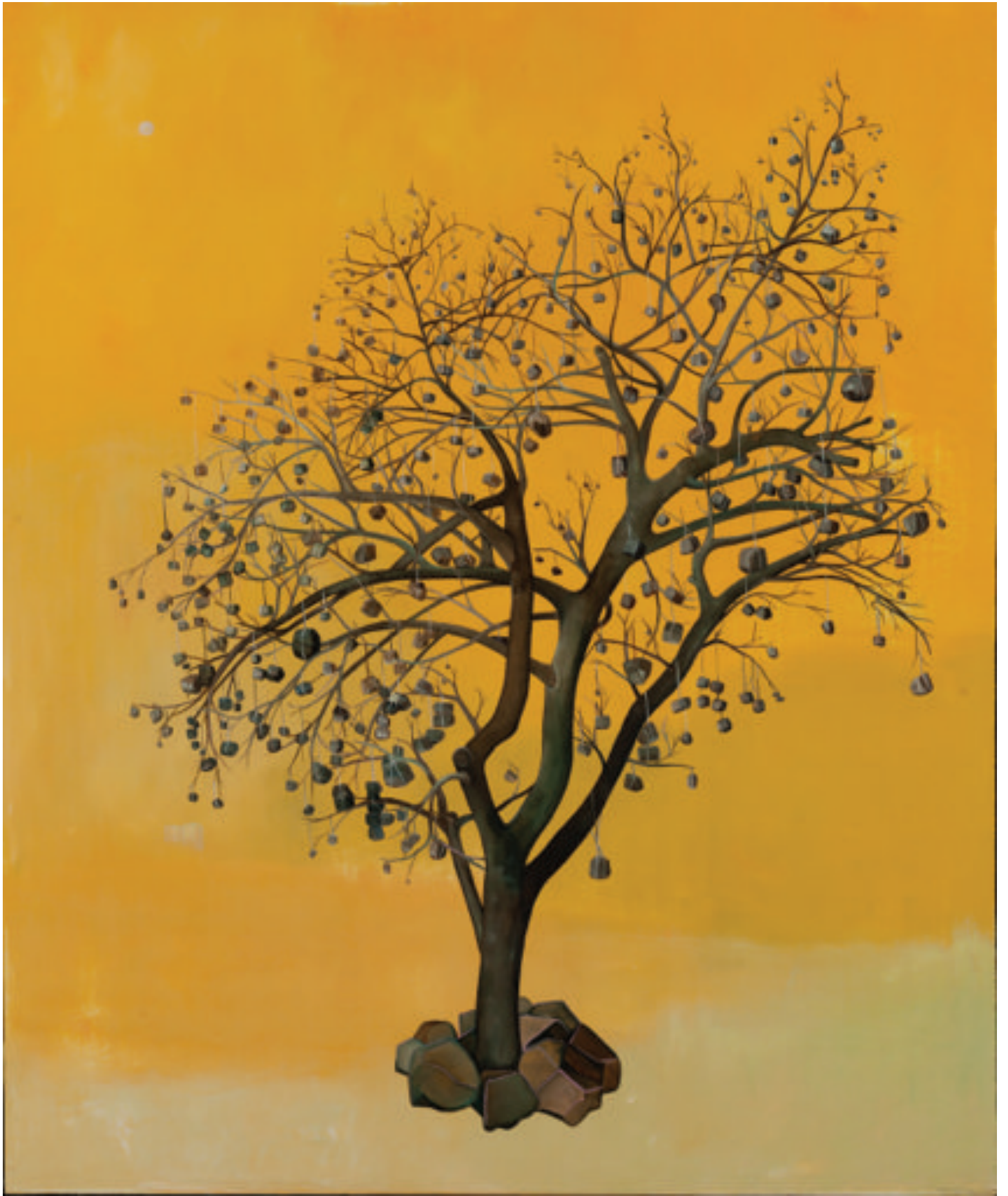
Northern Dream House, 2013, oil on panel, 7" x 5"