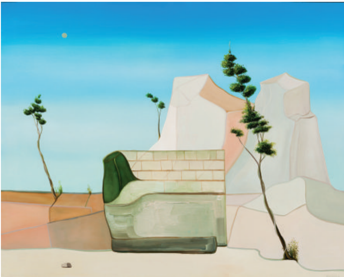
Ancient Stone Quarry 2, 2014, Oil on Panel, 20" x 16"