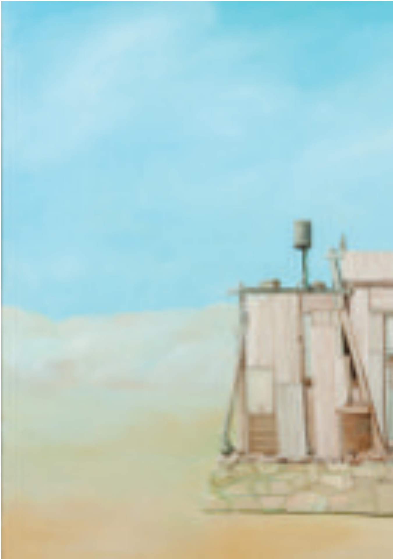
Beach Shack, Low Tide, 2014, Oil on Panel, 56" x 45"