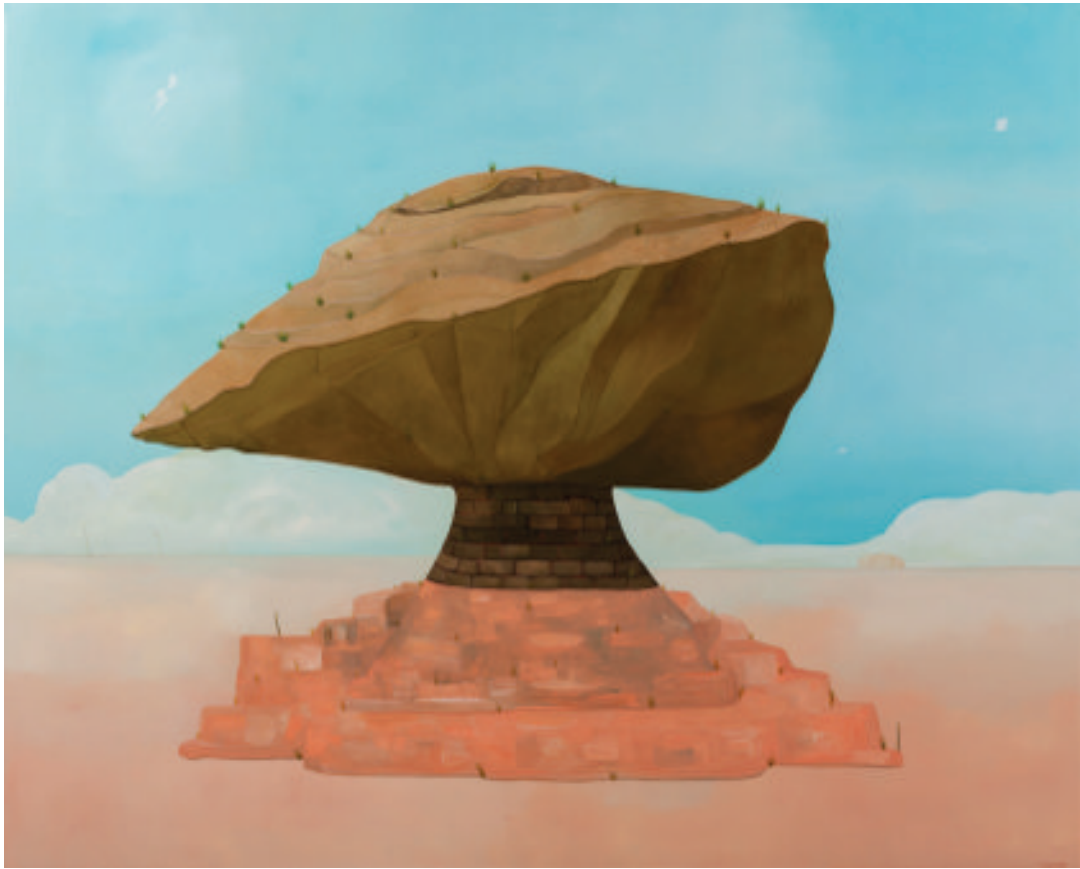
Ancient Shelter 2, 2014, Oil on Panel, 45" x 56"