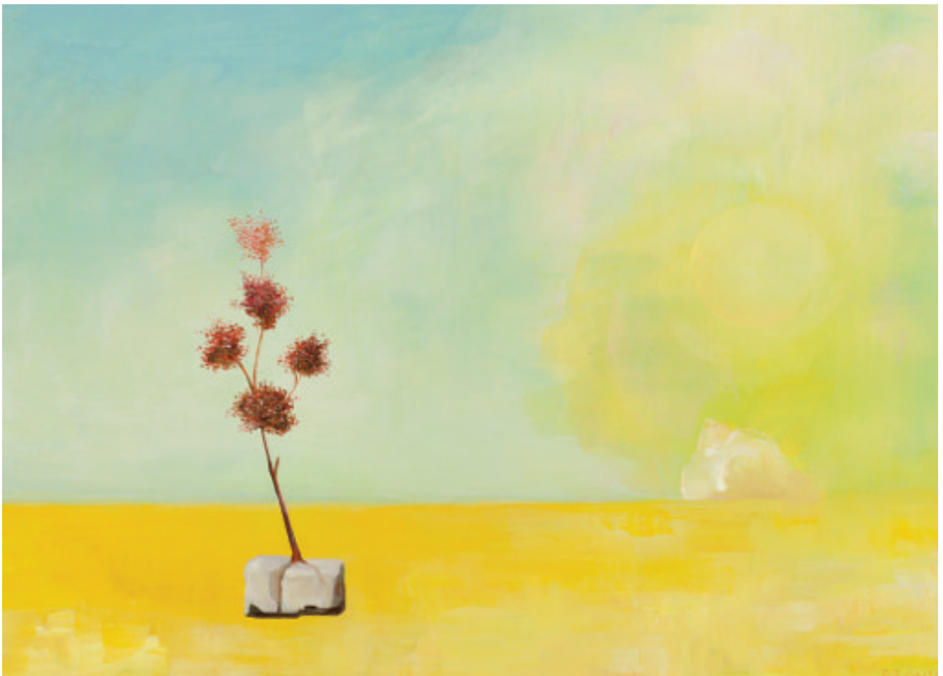
Red Tree 1, 2013, oil on panel, 5" x 7"