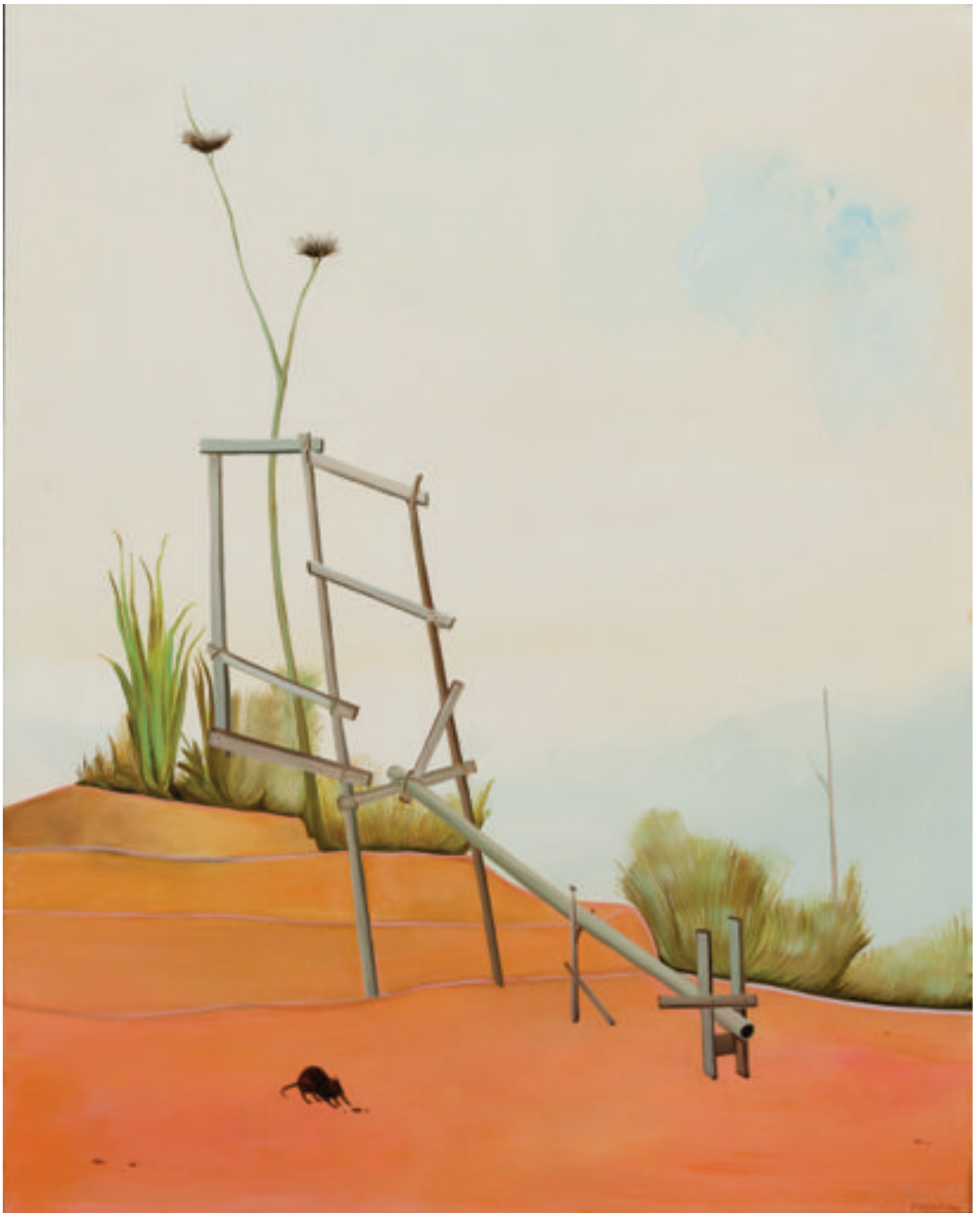
The Last Well, 2014, Oil on Panel, 16" x 20"