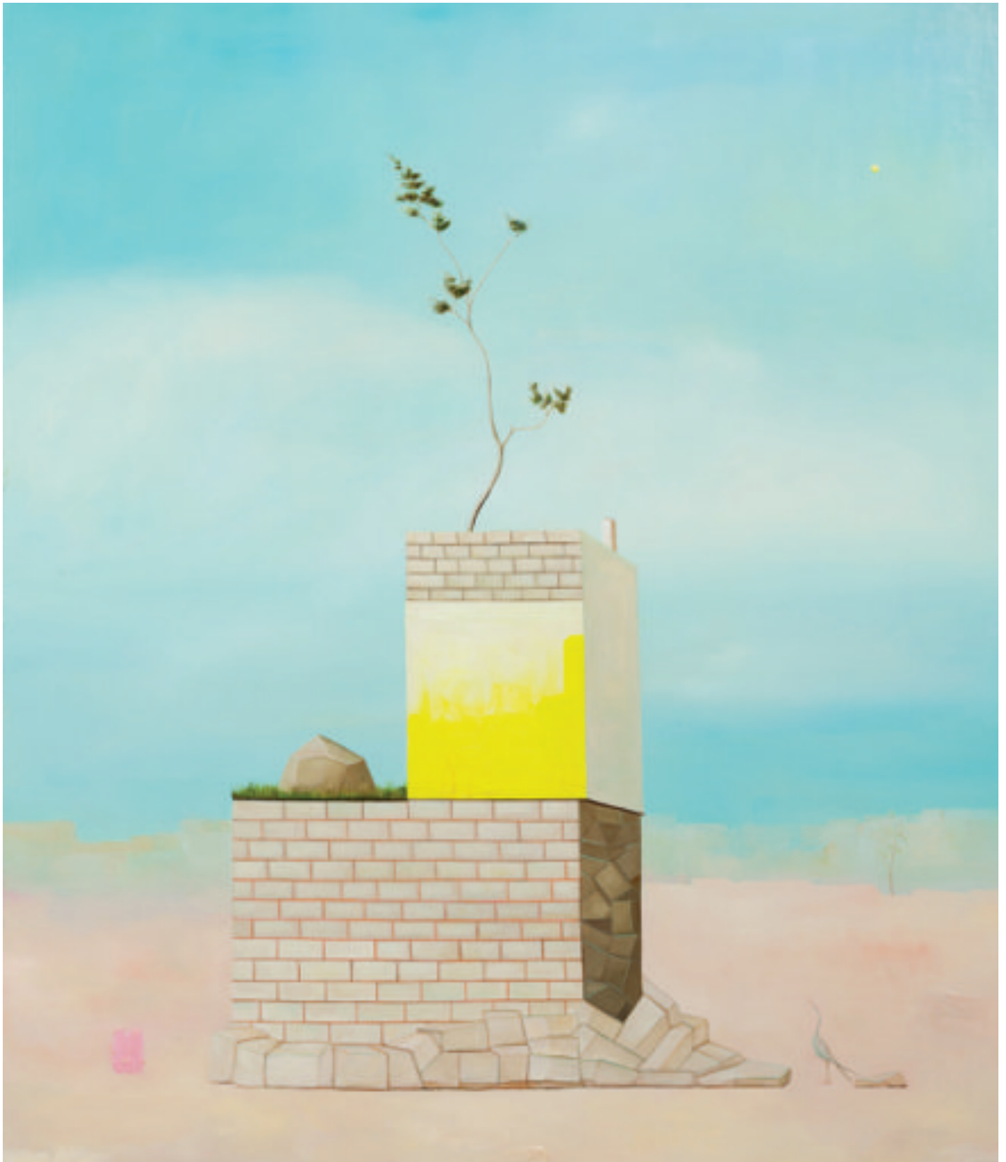
The Artist's Studio, 2014, Oil on Panel, 38" x 45"