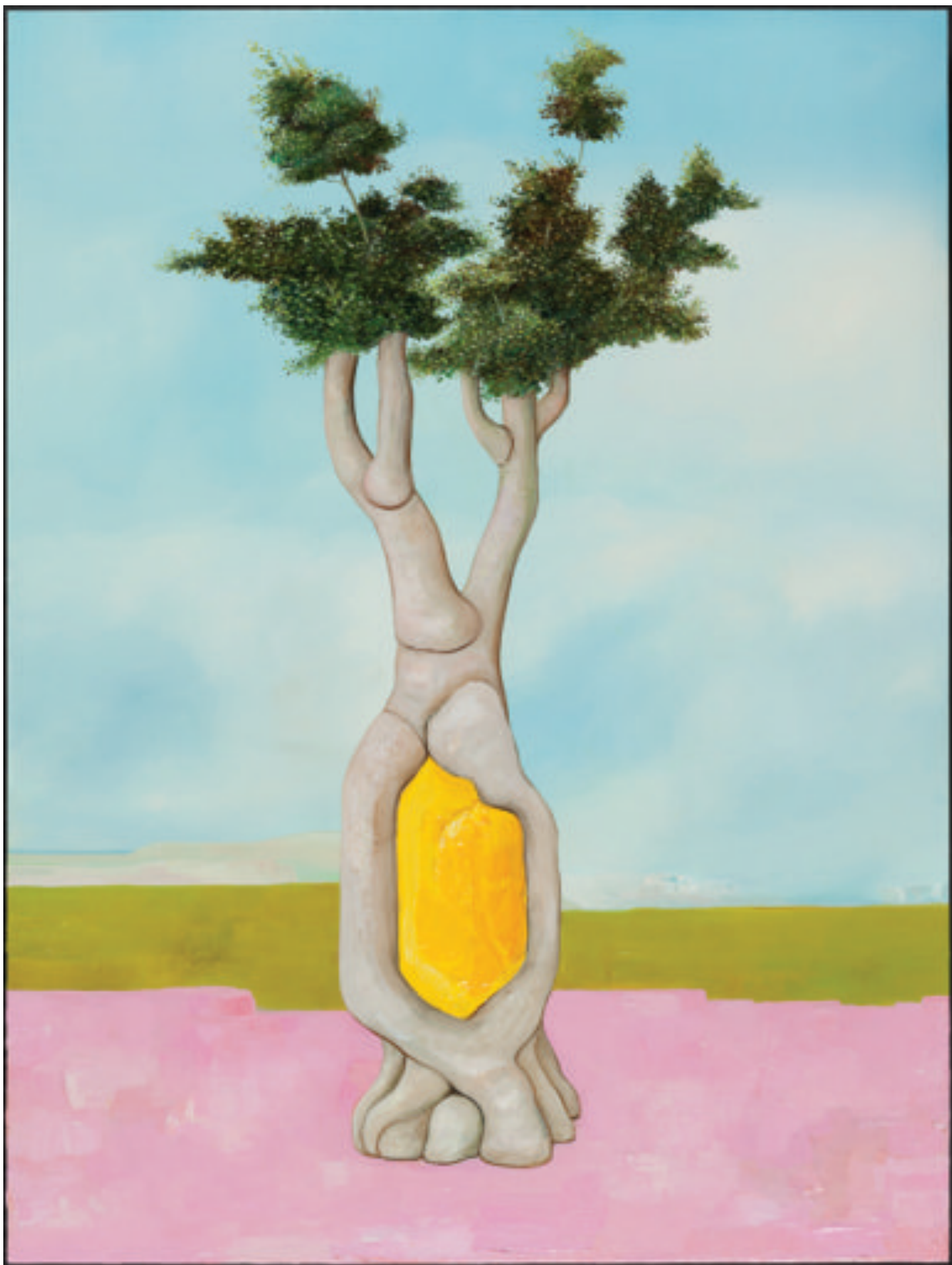
Northern Dream House, 2013, oil on panel, 7" x 5"