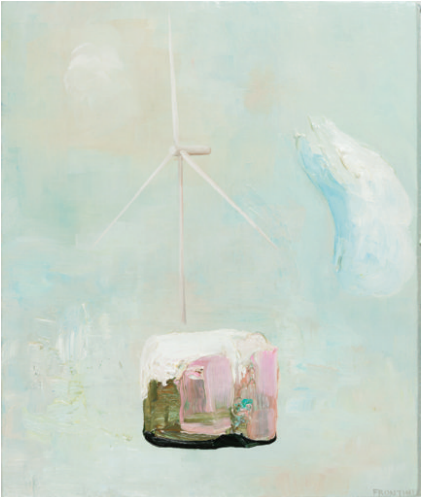
Northern Dream House, 2013, oil on panel, 7" x 5"