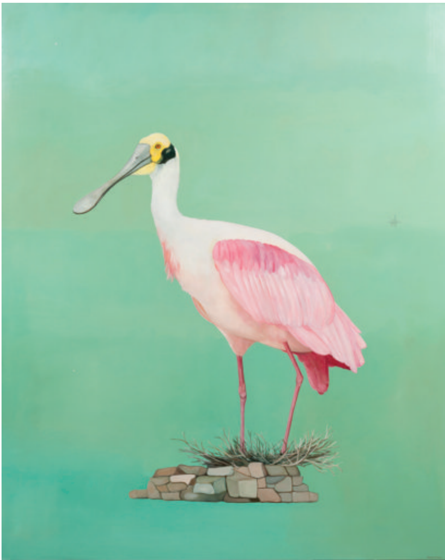
Spoonbill, 2014, Oil on Panel, 45" x 56"