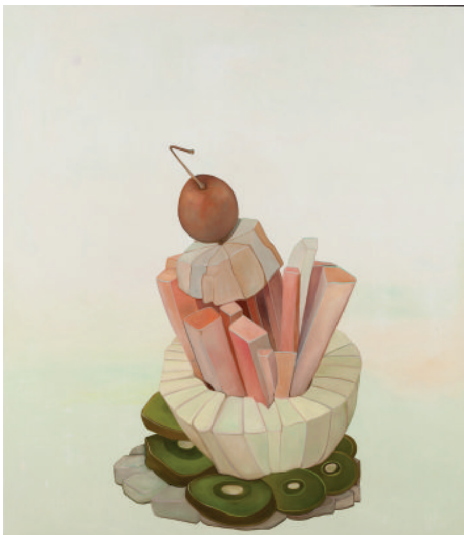
Northern Fruit Cup, 2014, Oil on Panel, 36” x 45”

Exhibition Catalogue William Busta Gallery December 2014