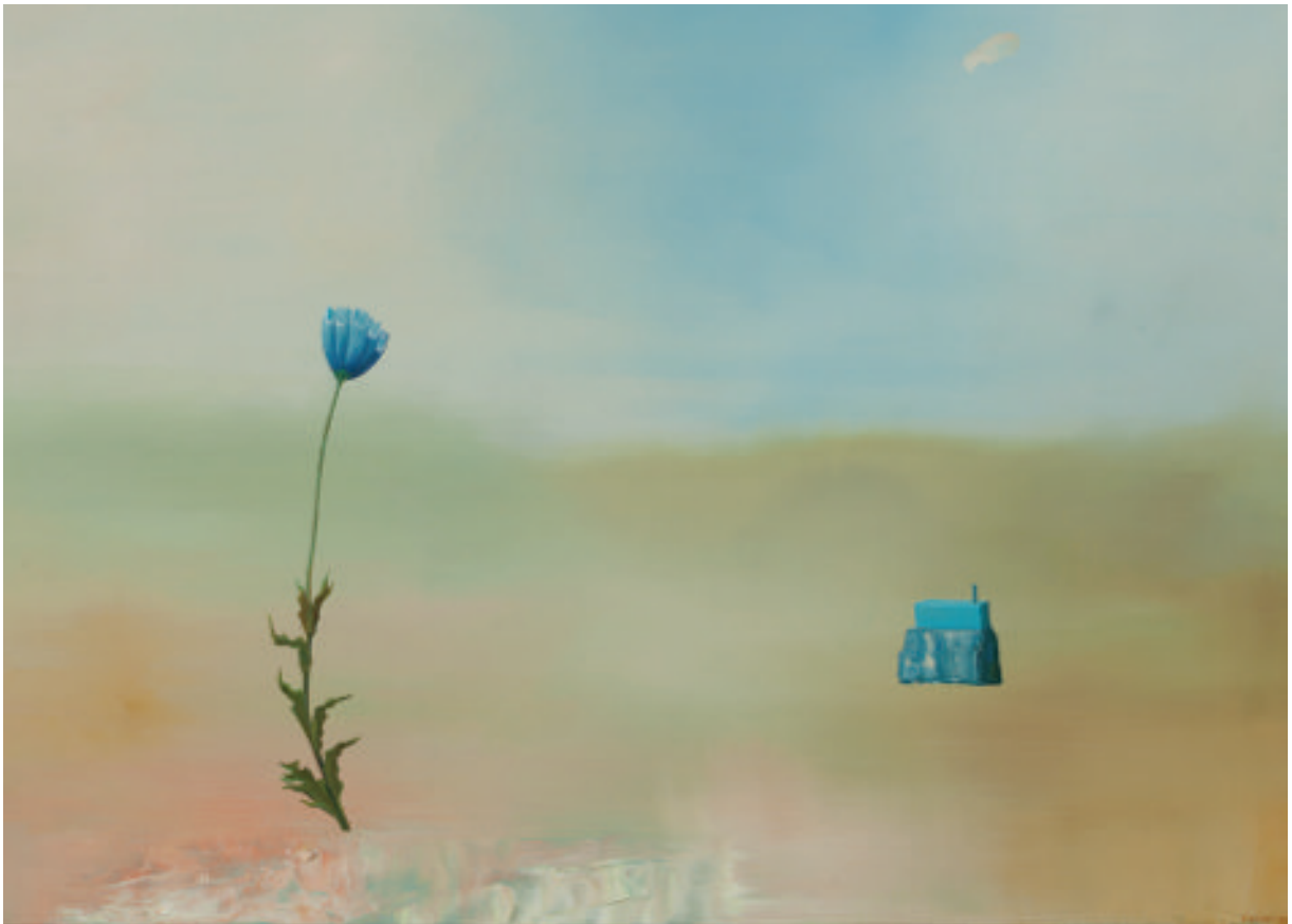
Blue Factory, 2013, oil on panel, 16"x 20"