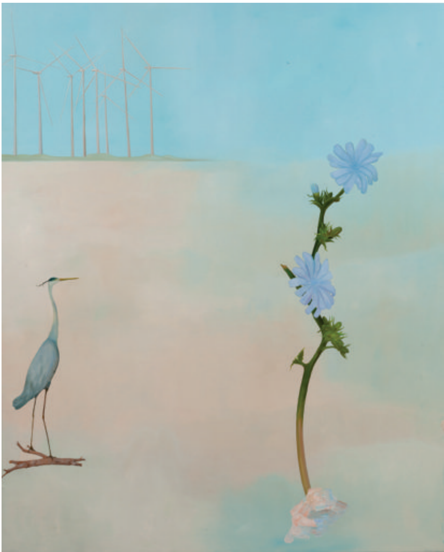
On the Vine, 2013, oil on panel, 20" x 16"