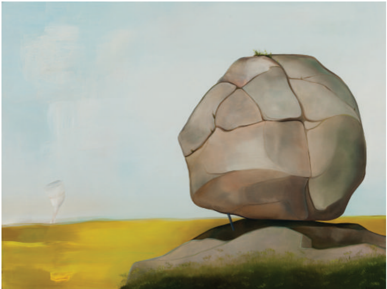
Lone Boulder, 2014, Oil on Panel, 12" x 16"