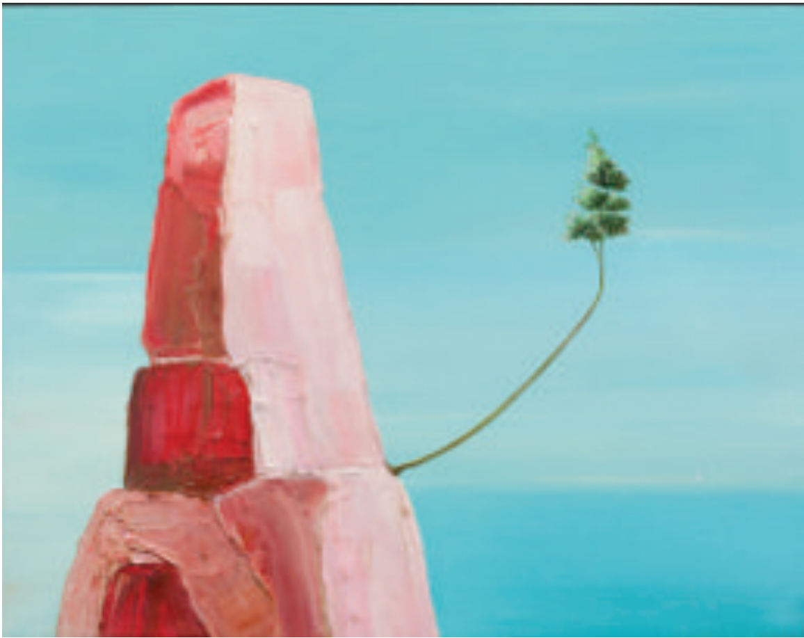
Tree by the Shore 4, 2014, Oil on Panel, 11” x 14”