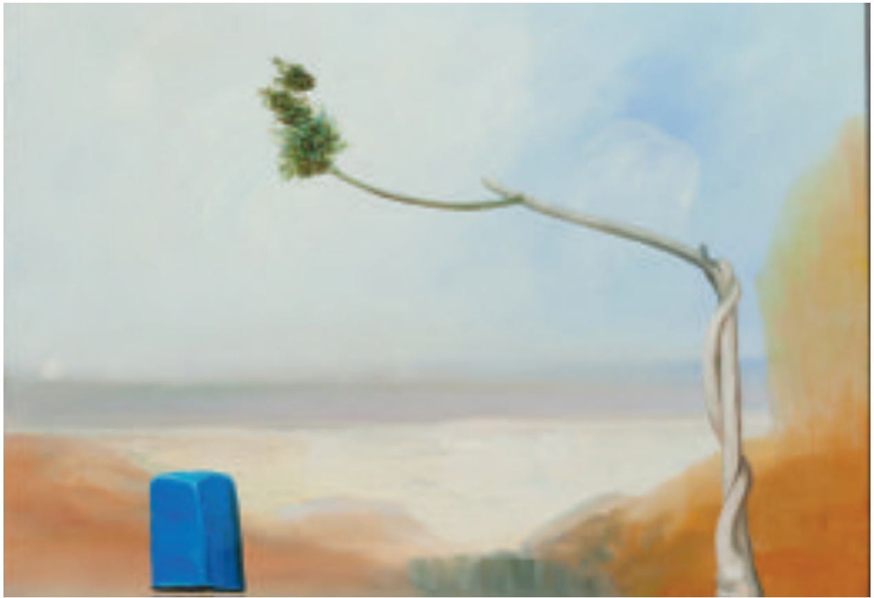
Blue Rock 3, 2013, Oil on Panel, 11" x 14"