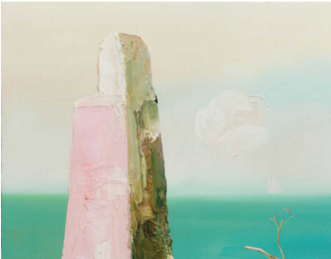
Ancient Alter 2, 2014, Oil on Panel, 12" x 16"