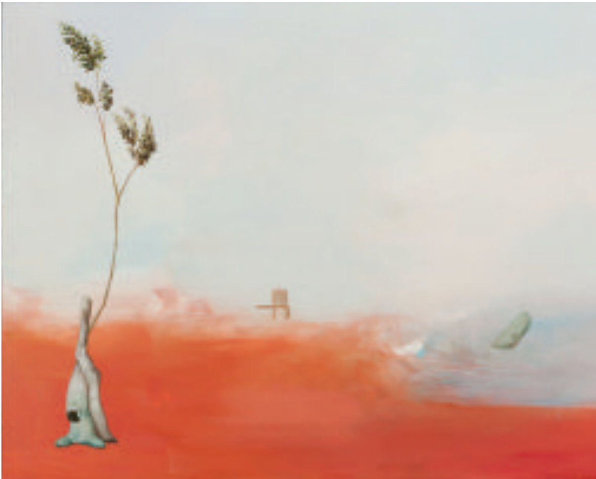
White Tomato, 2013, oil on panel, 14" x 16"