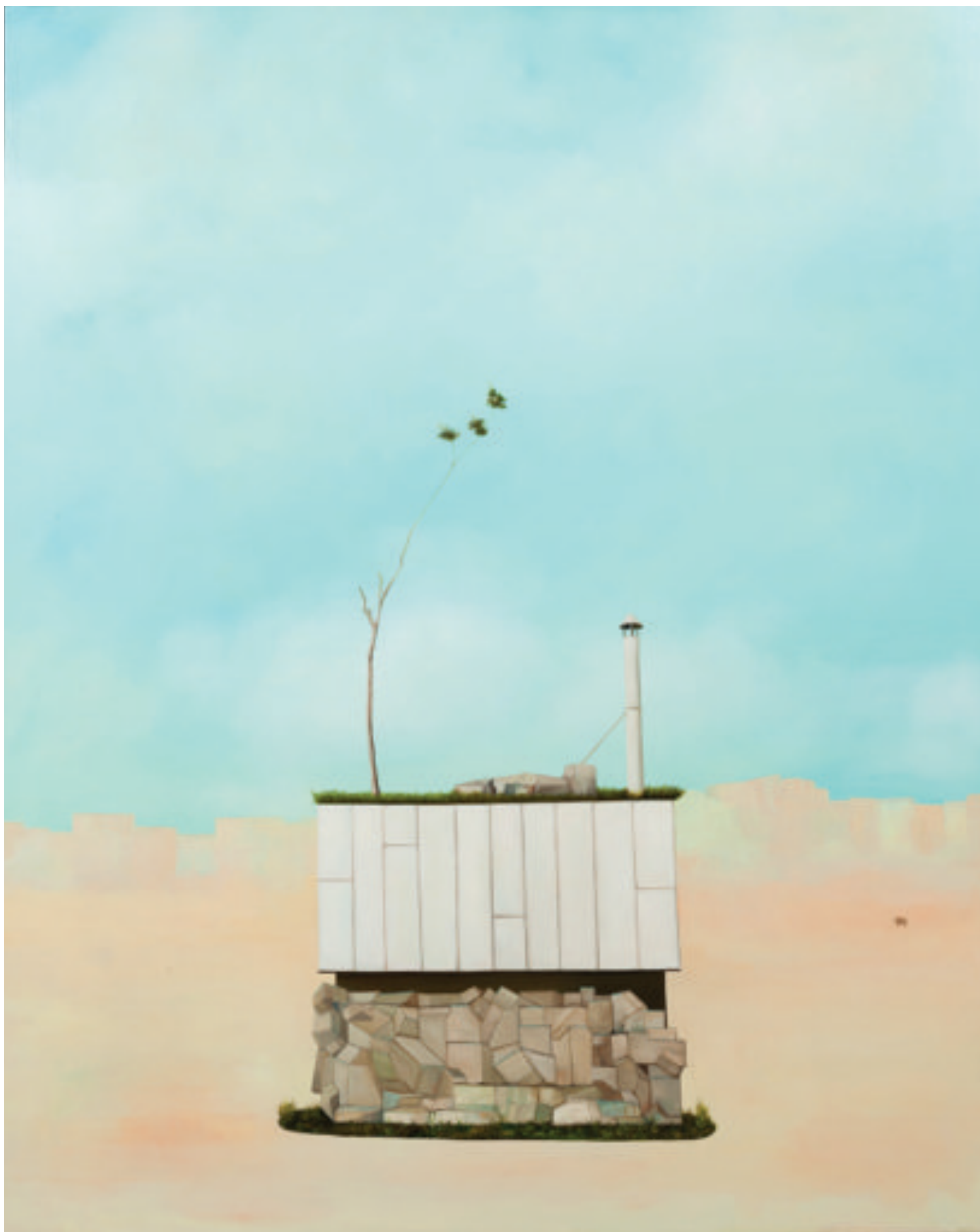
The Oasis, 2014, Oil on Panel, 45” x 56”