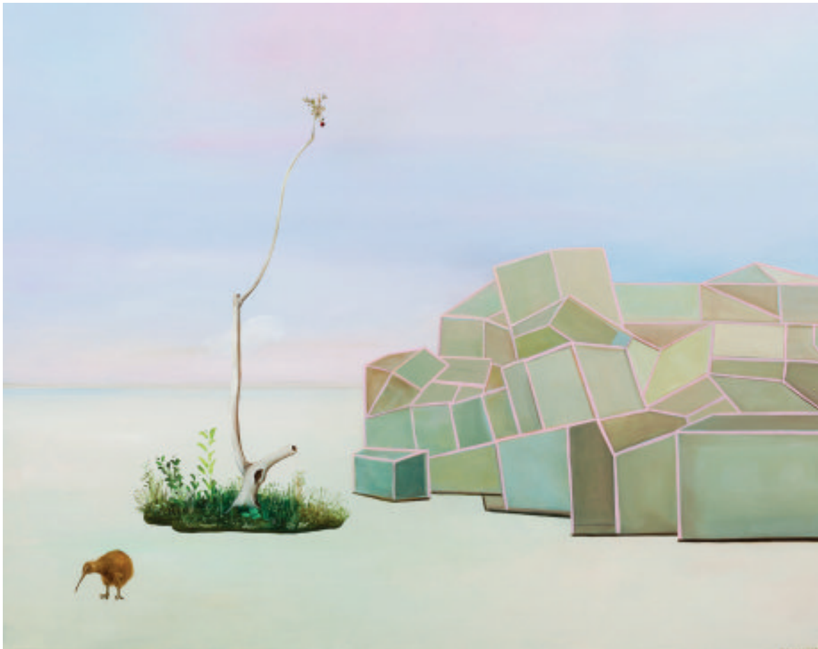
Kiwi of the Oasis, 2014, Oil on Panel, 16" x 20"

in the sides of the Apennines; or we may have seen them dotting the same kinds of hills and dales in landscape painting from the 15th and 16th centuries. Indeed, Frontini's imagery has been compared to that of the proto-Renaissance, and to a certain extent we might consider him the latest Sienese miniaturist.