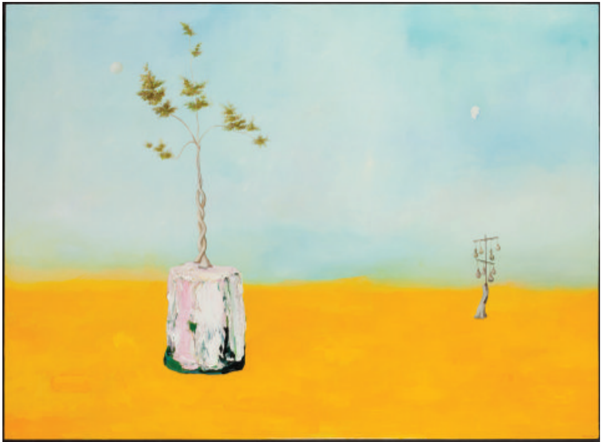
Tree by the Shore 4, 2014, Oil on Panel, 11" x 14"